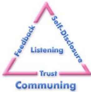
Figure 2 Communing.

Communing: This refers to communication which occurs between persons who are aware of the presence of each other. It is very important for nurses to engage in humanizing communication because patients will reveal things to the nurse, which are expected to be not disclosed to anyone else. Communing further consists of following three sub elements (as shown in table 4 and Figure 2):