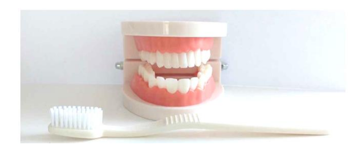
Illustration 2. Model teeth and a toothbrush that were used to demonstrate brushing the teeth

right grip of the toothbrush was found, we took this experience a little further – the participants moved on to painting with the toothbrushes. Everyone got to paint a tooth (about the size of a thumb) made from magic dough. This gave the children an experience where they could see the paint as the trades of the toothbrush, and possibly that way get a deeper understanding of brushing. If there were time, the children could continue painting with the toothbrushes on paper.