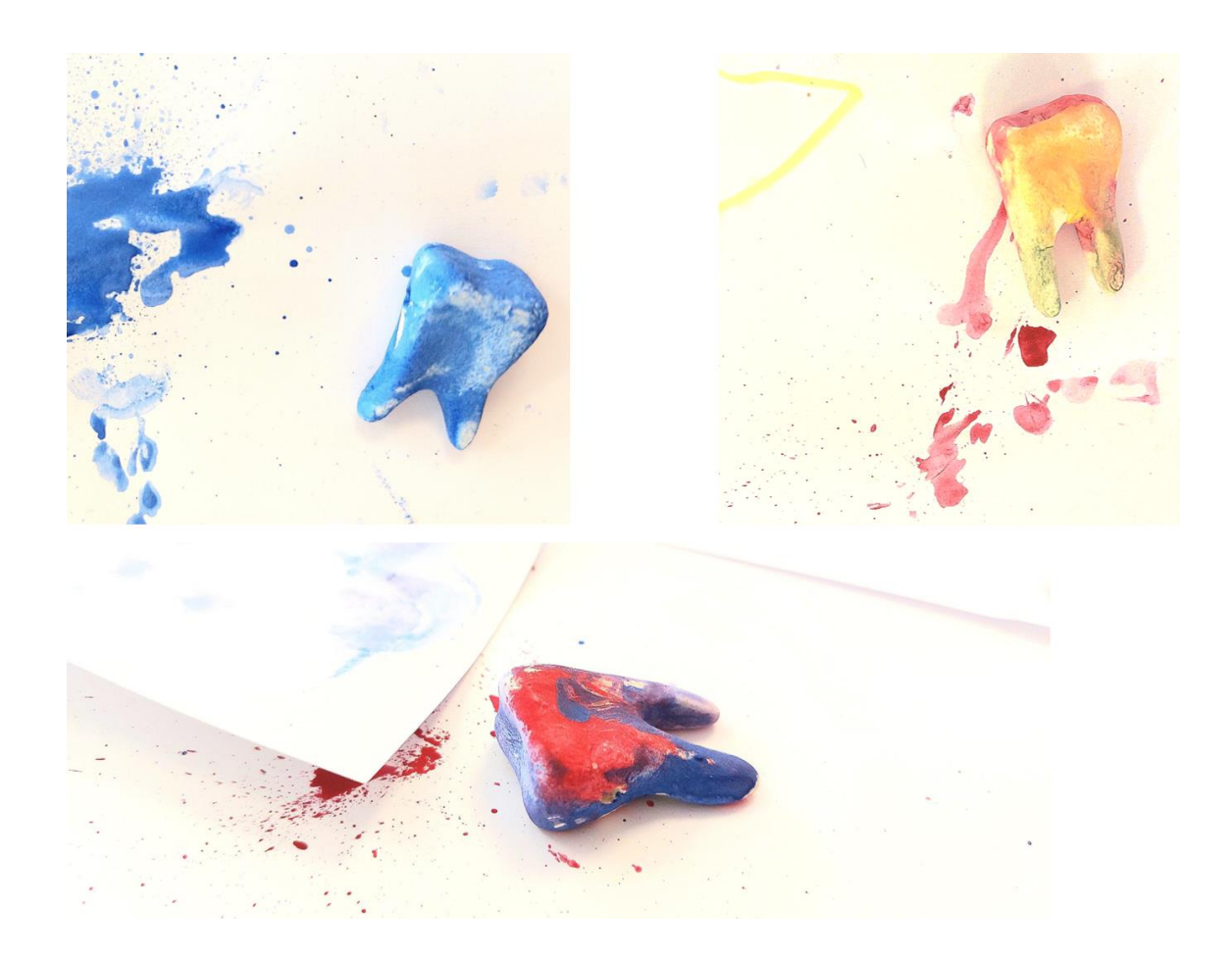
Illustration 4. Some of the teeth (made of magic dough) painted by the participants

The brushing activity made sure everybody was able to hold a brush, and then we moved on to painting with the toothbrushes. Everybody got to choose a tooth made out of magic dough and paint it as they liked, while at the same time practice their brushing skills. This assignment was received with enthusiasm amongst the children: "It is quite funny to paint with a toothbrush", "Can I keep this (tooth made of magic dough)? Oh yeah!"