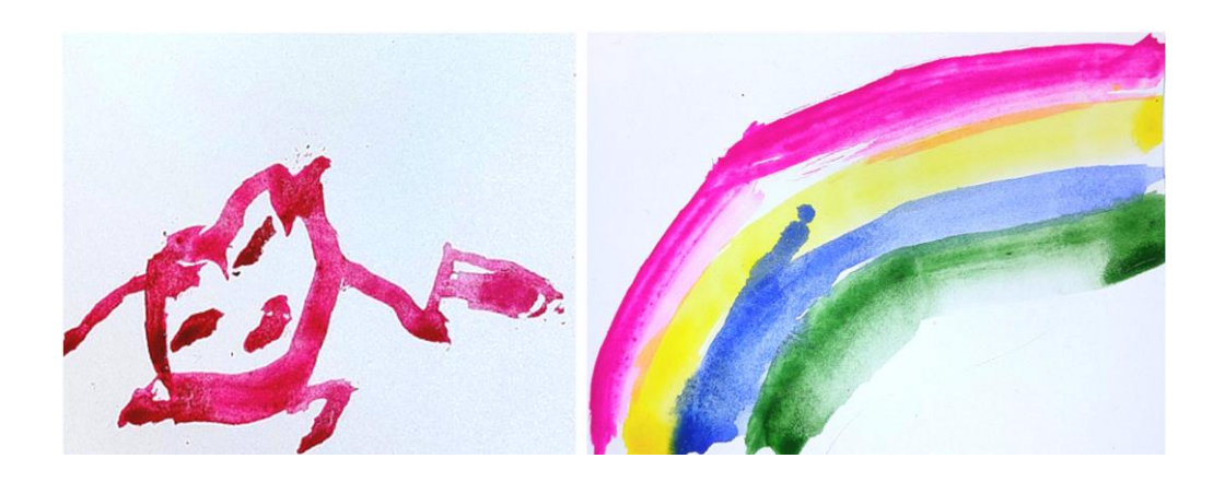
Illustrations 6. Cover sides of the greeting cards for guardians showing "a tooth troll running away from the dentist", and a rainbow, painted with toothbrushes

The cover side of the greeting card for guardians provided space for the children to paint a picture of their choice with a toothbrush. The pictures of the participants included hearts, rainbows, a tooth troll, a tooth fairy, a toothbrush, an airplane, a windstorm, and a lot of teeth — in fact, the participants of the third workshop decided all to paint a picture of a tooth. These paintings had feelings and thoughts of individuals' as well as the workshop groups' (Corbin et al. 2021: 5; Rissanen 2022: 145–147.). I thought the last workshop group's joint decision to paint teeth, was also a pleasant surprise of the group's free discussion and reflected the strong sense of community these children had (Aro 2011: 52-53).