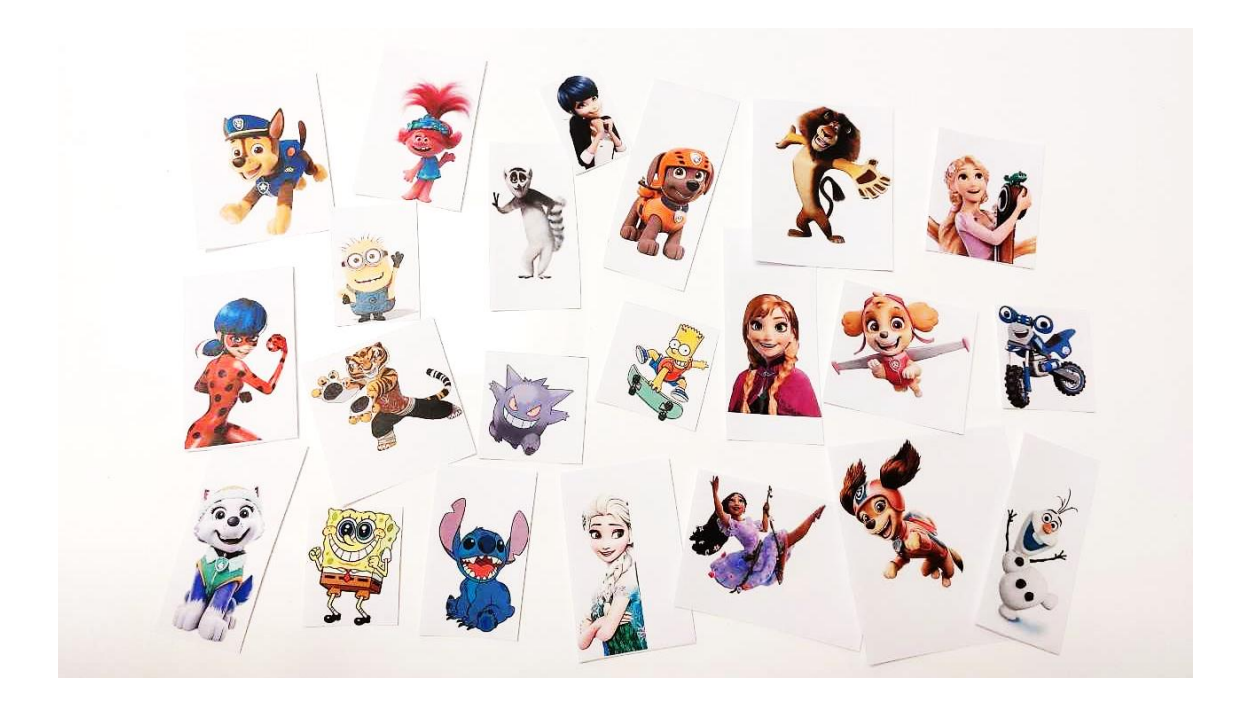
Illustration 1. Pictures of smiles the participants and the kindergarten staff chose during the introduction activity

As a mother I have noticed the power of using fictional characters to explain and motivate my children. For example, Etchells and Tonkin (2019: 107) write, that the beloved Peppa Pig has been noticed as "a valuable health promotion resource." Therefore, for the introduction activity I chose to have smiling pictures of fictional characters from children's movies, tv-series, and stories. Using these pictures was aiming at a low threshold introduction: everybody choses a picture they like and introduce themselves and share the picture they have chosen with others.