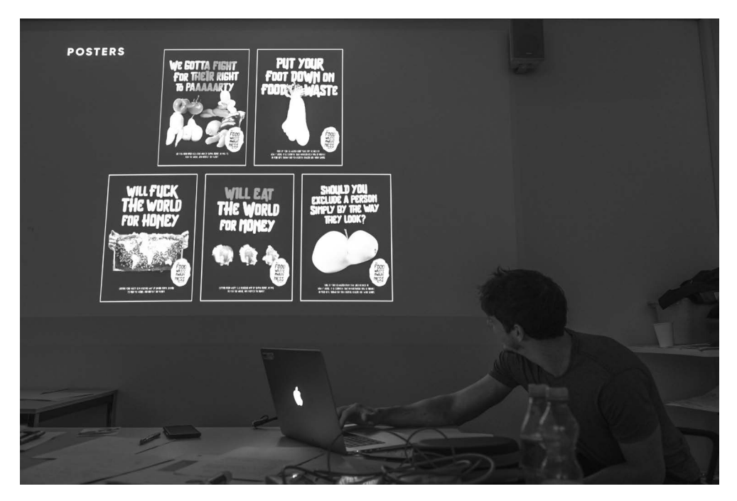
Figure 22.7 Poster project Ugly Food . VICAT Berlin workshop.

sympathy resulted from the final posters of anthropomorphised produce requesting to be taken home. In another project, images of common personal clothing were labelled with data of the materials, origin, and the environmental damages caused in their making. The concept was that the average westerner would connect with the familiarity of the clothes but then be confronted with a more distant problem. This connection between personal and remote realities aimed to raise conflicting emotions that required some resolution. Both projects came from research into statistics about food waste and fast fashion, but the art-making process resulted in outputs for evoking felt responses in viewers and the poster format created materials that could easily be duplicated and distributed into public spaces to reach a broad audience.