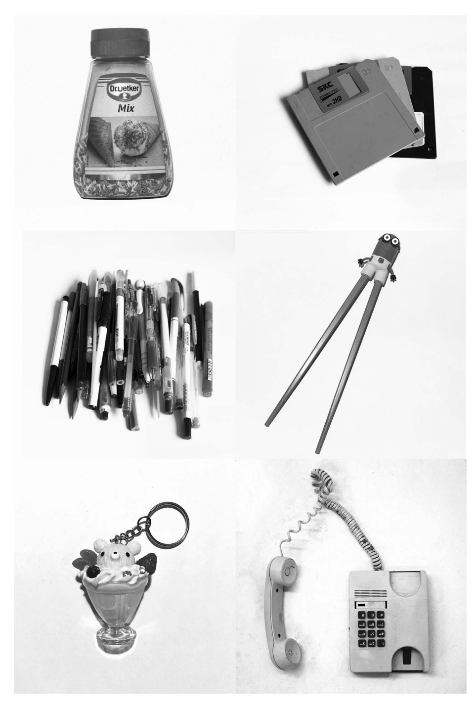
Figure 22.6 Co-creation project Useless Objects from the exhibition Turmoil , at the Off Festival, Bratislava, Slovakia, 2017.