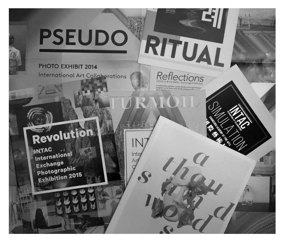
Figure 22.5 Examples of INTAC exhibition catalogues. Source : The authors.

Co-creation art to catalyse competencies