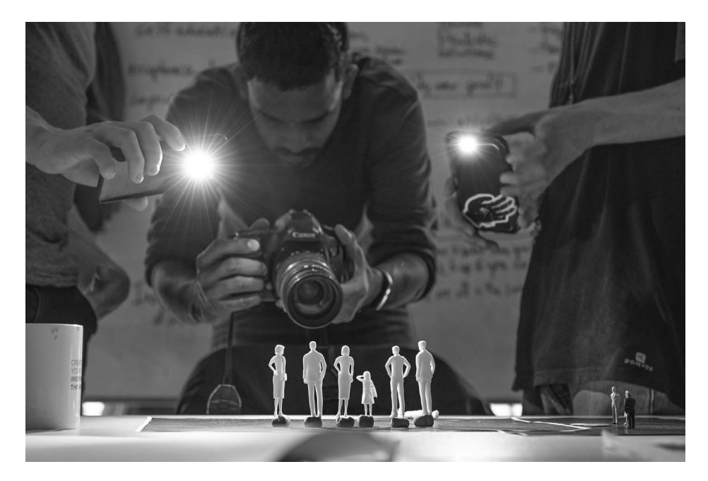
Figure 22.1 Co-creation in process, Visual Catalysts workshop, University of Europe for Applied Sciences, Berlin 2019.