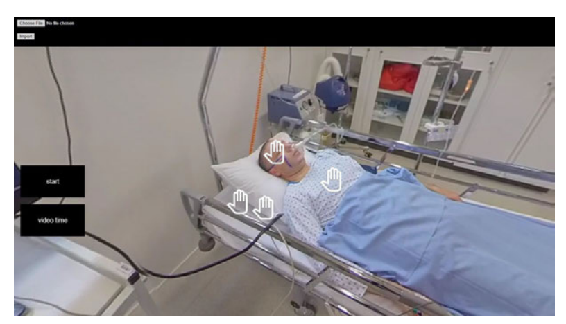
Photo 1. The learning task hotspots were placed on the white hands.

The case was completed in the autumn 2022. The manuscript followed the common post-operative steps of observation using the ABCDE- protocol. The manuscript had to contain detailed structure of the filmed videos, the learning tasks and flowchart of the process. The players possible choices and routes of progress had to be estimated carefully. The case contained learning tasks concerning monitoring, examining, observing the vital signs of the patient according the ABCDE-protocol. In addition, the case contains temperature, pain, nausea and vomiting managements and reporting using the ISBAR-protocol. Students proceeding depended on the choices made and the student received the feedback regarding the answer. The simulation training episode followed a flowchart, and learning tasks were located on video spots, which the students found marked as hands on the 360° video.