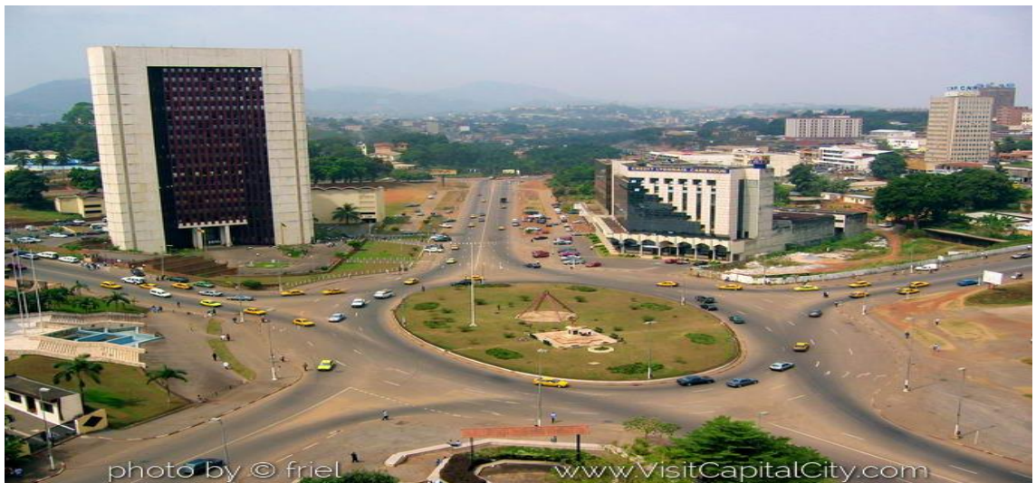
Image 1. Yaounde, the capital of Cameroon (Visitcapital city.com, no date ).

mention that "The country has a very rich cultural diversity that is reflected in its 200 ethnic groups with varied cultures. The writers add that, most African cultures can be experienced by just visiting Cameroon alone thus, the country has long been dubbed 'The African in miniature', meaning all cultures of Africa found in a one country." (Akuri & Ndingi 2013, 36). Looking at the fact that, the indigenous people are very important in the tourism scene today, it is important to find out the effects of tourism activities on the people and the role of the Cameroon government and other stakeholders of the tourism industry in protecting these people from the negative impacts of tourism. In this report, we will be focusing on the Cameroon Pygmies as a case study.