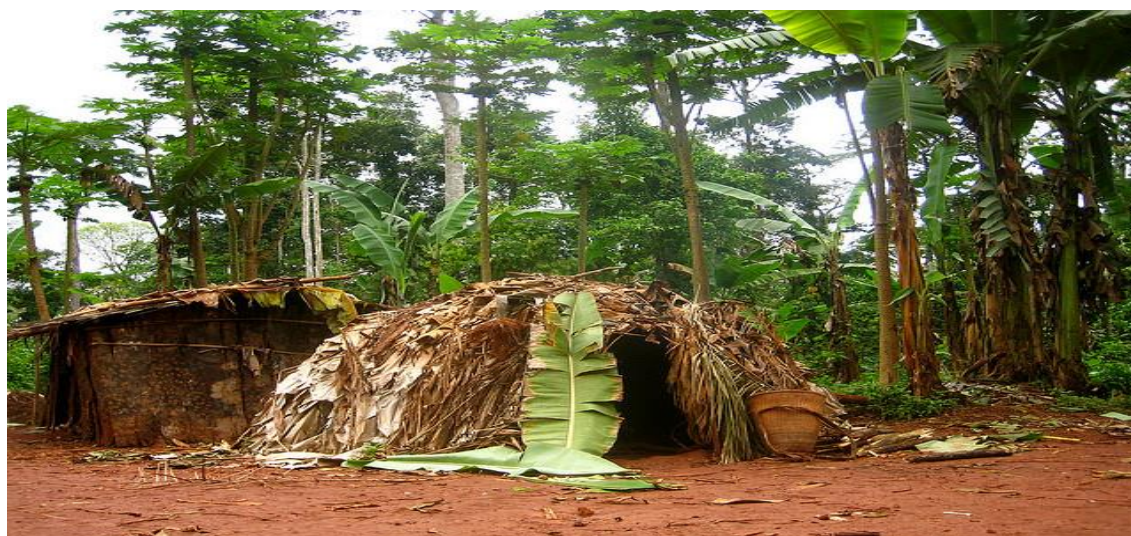
Image 7. A Baka pygmy hut in Cameroon. (Trip Down Memory Lane,2013).

As mentioned earlier, on the opposite of intangible are tangible cultures, which are visible aspects of the culture that can be touched. The tangible culture of the Pygmies includes but is not limited to huts, musical instruments and sacred places. All these valuable cultures are under threats or we risk losing them in the nearest future. Devin(2014) examines that, "Traditional Baka huts are called môngulu. They are typically shaped one-family houses made of branches and leaves and predominantly built by women. After a hemispheric framework of flexible, thin branches is prepared, big recently-gathered leaves of Marantaceae plants fit in the structure. Once the work is done, other vegetable material is sometimes added to the dome in order to make the structure more compact and waterproof".