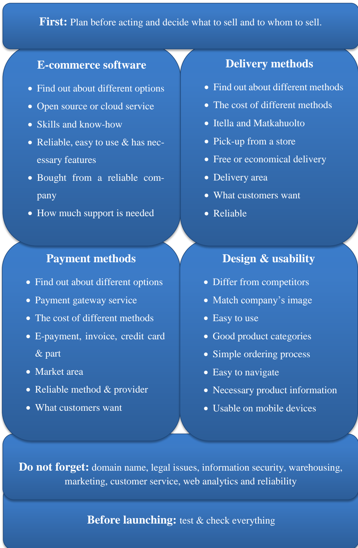
Figure 3. The key points of building an online store.