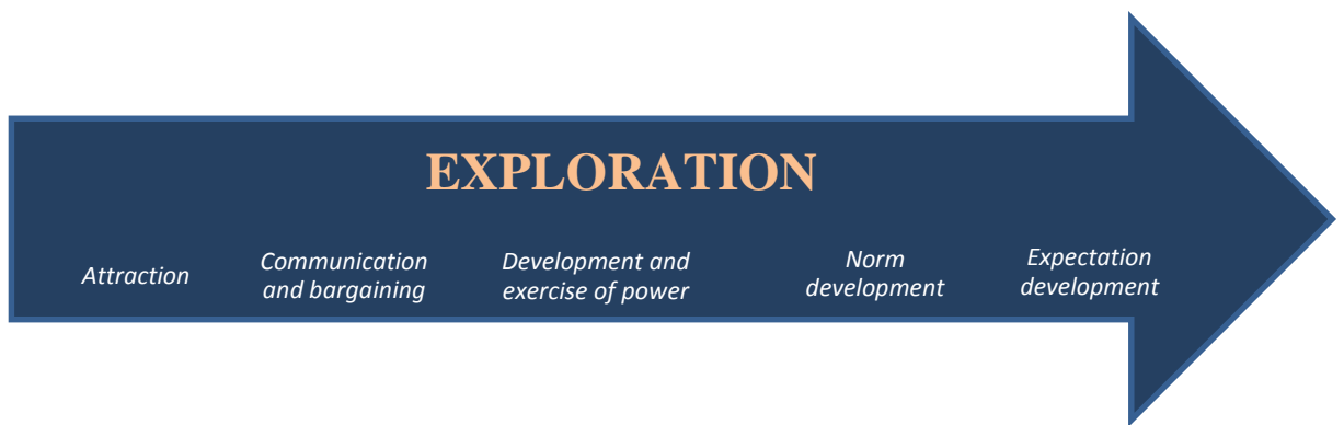
Figure 3: Sub-stages of exploration phase

Exploration is the second phase after the awareness. It begins when the first bilateral interaction is done. It is the phase of the search and trial, testing and evaluation in the relationship. The first discussions about each party's own objectives, obligations as well as the possibility of the relationship. This phase theoretically follows five steps (Dwyer, Schurr & Oh 1987).