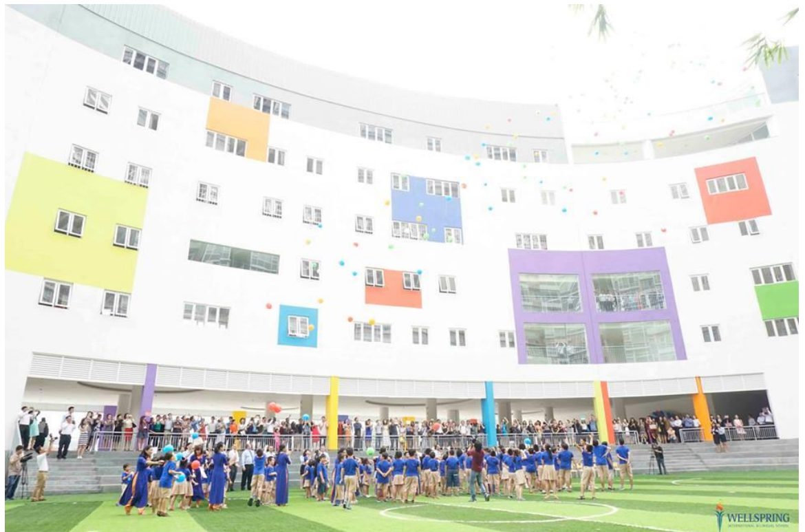
Figure 1. The opening ceremony of Wellspring Saigon and the school year 2014-2015

Besides the bilingual program, Wellspring Saigon guarantees the environment for students to feel comfortable in school. Students can be provided with school-bus service, meal service and learning tools (Wellspring International Bilingual School Saigon, 2014).