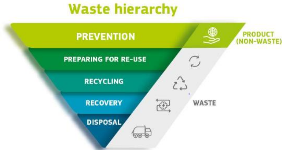
Figure 2. Waste Hierarchy (European Commission, 2022)

The waste hierarchy is introduced to EU member states to maximize resource efficiency. It is a key component of the PPWD. Waste can be managed according to the hierarchy outlined below, with prevention being the most preferred method.