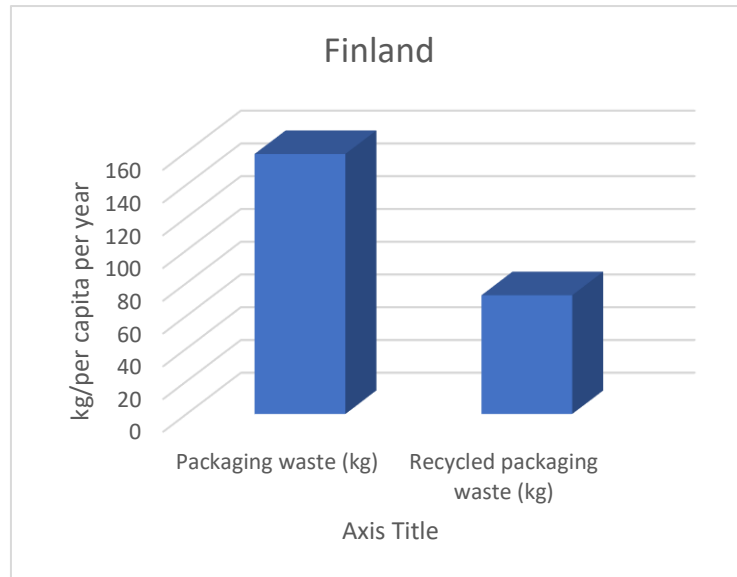
Figure 3. Packaging waste recycling in Finland, 2022 (Own editing based on Eurostat database, 2024)

According to the Eurostat database, Finland generated 159.86 kg of packaging waste per capita in 2022, of which 73.5 kg per capita was recycled (Figure 3). These numbers highlight Finland’s commitment to improving packaging waste management and reducing the environmental impact of waste through effective recycling systems.