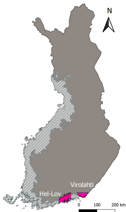
Figure 1. Location of the study areas (pink color) and the maximal extent of the Littorina Sea (diagonal lines). Both study areas are located in the Littorina Sea.

For this study, two different study areas in the south of Finland were considered: Virolahti and its surroundings, and a coastal area situated between the cities of Helsinki and Loviisa (Hel-Lov); see Figure 1. Both areas are located in the Littorina Sea, where AS soils are usually found. The land cover in these two regions mainly consists of bedrock, outcrops, and blockfields. Furthermore, the soils in both areas are similar. This has allowed us to carry out the study of this work.