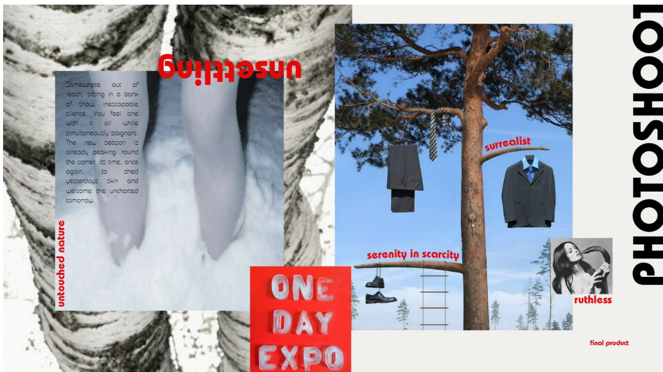
Figure 12 Moodboard for photoshoot

The imagined atmosphere of the editorial images felt most organic presented visually, in the form of a moodboard. The tone wanted to signal was the anticipation of something around the corner, while unable to pinpoint exactly what that something might be. The tingling whole body sensation, like a frost bite after wandering in the white drifts as far as the eye can reach, for hours on end.