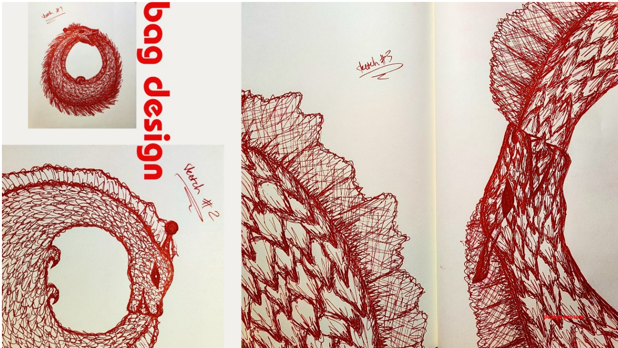
Figure 9 Sketching

The sketching process for the bag design began with the conceptualization of the shape, with inspiration being drawn from the Ouroboros symbol - representing cyclical renewal and the commitment to sustainability. A circular, looped form was naturally adopted for the bag, reflecting the idea of upcycling and the continuous cycle of life and materials. Surrealist influences were incorporated through the idea of scale-like textures, suggesting a snake's skin, which would be represented by upcycled plastic pieces in the final design.