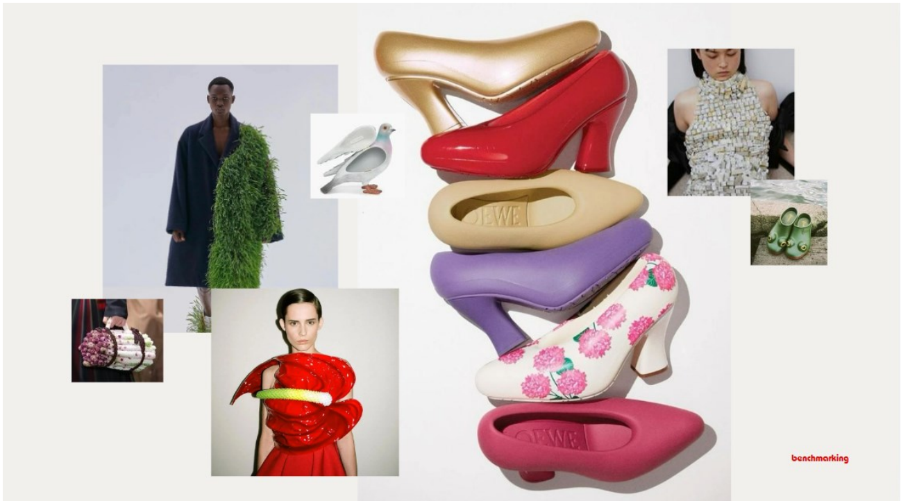
Figure 3 JW Anderson collage

Funky, fresh, and surrealist elements are at the core of Jonathan Anderson's design ethos, with both Loewe and his self-founded brand JW Anderson standing out in the luxury fashion industry. Anderson's work is often characterized by its playful, avant-garde approach to fashion, where traditional forms are deconstructed and reinterpreted with a bold, contemporary twist. At Loewe, a historic brand founded in 1846, new life is breathed into the label with eccentric accessories and garments that merge classic luxury with unexpected, surrealist elements. Whimsical shapes, like sculptural bags and oversized, distorted silhouettes are used, providing Loewe's collections under Anderson's reign, with a fresh, quirky edge. Meanwhile, his namesake brand, JW Anderson (founded in 2007), shares a similar sensibility, but with even more emphasis placed on experimental designs that blur the line between fashion, art, and functionality. Deconstructed garments that challenge conventional tailoring and unusual accessories are featured, with statements being made about individuality, often evoking a sense of surrealism that encourages wearers to rethink the boundaries in fashion.