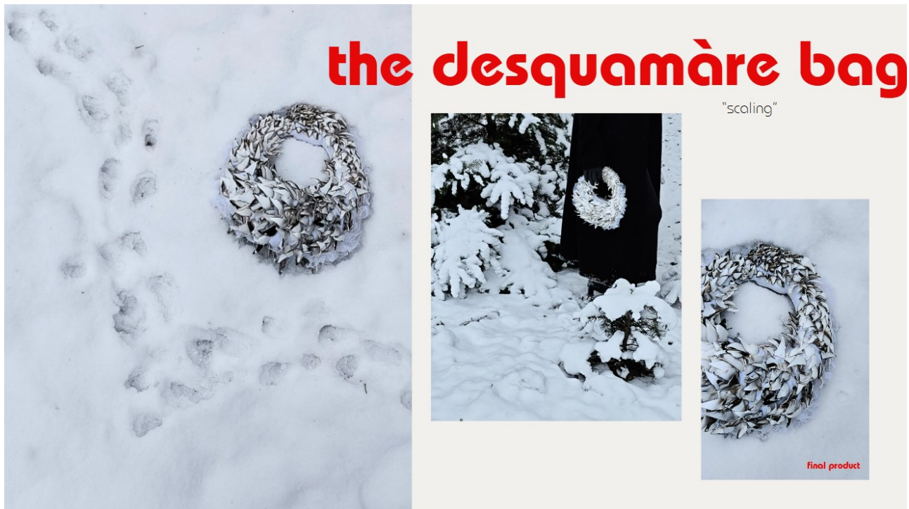
Figure 13 The Desquamàre ('scaling') bag