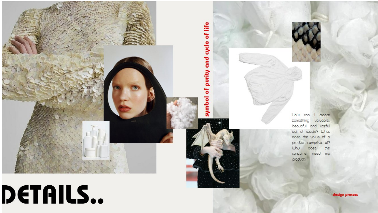
Figure 8 Moodboard of details

A moodboard of details for the upcycled accessory design was created, visualizing key elements that aligned with the core values of sustainability, creativity, and functionality. The focus was placed on showcasing waste materials, specifically plastic waste like polyester clothing and packaging, with the intention of turning them into something both beautiful and useful. The texture of snakeskin, inspired by the layered nature of plastic, was made a central design element, where a sequin-like effect was envisioned, created from repurposed materials to avoid the environmental impact of traditional sequins.