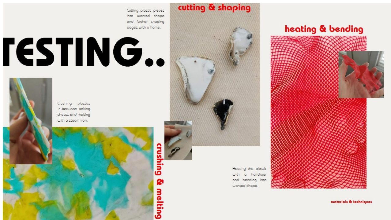
Figure 2 Technique testing

To repurpose plastic waste, hands-on, low-tech methods are employed. First, the plastic waste was carefully crushed between two sheets of baking paper, ensuring the material was evenly distributed. Then, a steam iron was used to gently melt the plastic at a controlled temperature, allowing it to fuse and form a solid, flexible sheet. The heat from the iron softened the plastic without burning it, enabling the creation of smooth, durable surfaces suitable for various design ideas. This technique was not only efficient but also provided a way to test PP and PET plastic, assessing their melting points, texture, and durability under pressure. The outcome was a unique, upcycled surface that offered both functionality and aesthetic potential.