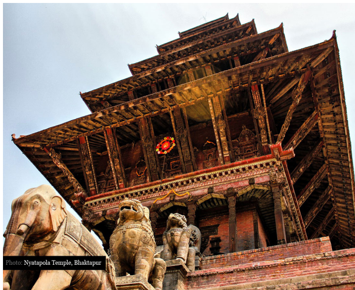
GRAPH 2. Nyatapola temple Bhaktapur (The longest way home, 2015)

tern (named as Pagoda pattern by Westerners), Stupa pattern and Shikhara pattern and arts are paintings and statue of deities. The Multi-roofed pattern of architecture has a tower with several layers of roof, with broad space of carved wood struts and the roofs are typically crowned by triangular spires surrounding them and lattice windows (see graph 2). This pattern of historical temples and buildings represents authentic and artistic architectural design of Nepal, which was mostly constructed during medieval period. Taleju, Pashupatinath, Changu Narayan, Datatraya and Nyatapola temple of Kathmandu valley are some examples of Multi-roofed pattern of Nepalese architecture. Nyatapola temple of Bhaktapur is the tallest temple of Nepal, which was constructed in 1702 during the reign of King Bhupatindra Malla (Lonely Planet 2015). (Nepal Link 2015b.)