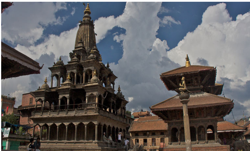
GRAPH 4. Krishna Mandir Patan (Nepal Visitors 2014)

The Shikhara patterns of temples are the most prominent Hindu and Buddhist shrines. The architectural structure of these temples consists of five to nine vertical sections forming a pyramidal structure or curvilinear tower and has a beautiful pinnacle at the top (Nepal Link 2015b). Krishna Mandir (see graph 4.) is the finest architecture completely made up of stone in Shikhara style, which was built by King Siddhi Narsimha Malla in 1637 A.D. (Nepal Visitors 2014). This temple is in Patan Durbar Square Protected Monument Zone and it has been inscribed in WH lists as a component of Kathmandu Valley WH Property.