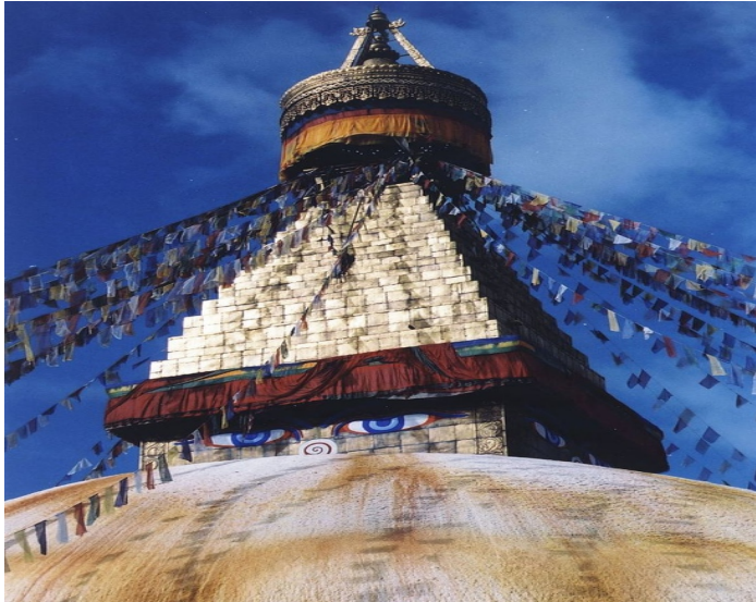
GRAPH 3. Boudhdhanath Stupa (Wainright 2015)

The Shikhara patterns of temples are the most prominent Hindu and Buddhist shrines. The architectural structure of these temples consists of five to nine vertical sections forming a pyramidal structure or curvilinear tower and has a beautiful pinnacle at the top (Nepal Link 2015b). Krishna Mandir (see graph 4.) is the finest architecture completely made up of stone in Shikhara style, which was built by King Siddhi Narsimha Malla in 1637 A.D. (Nepal Visitors 2014). This temple is in Patan Durbar Square Protected Monument Zone and it has been inscribed in WH lists as a component of Kathmandu Valley WH Property.