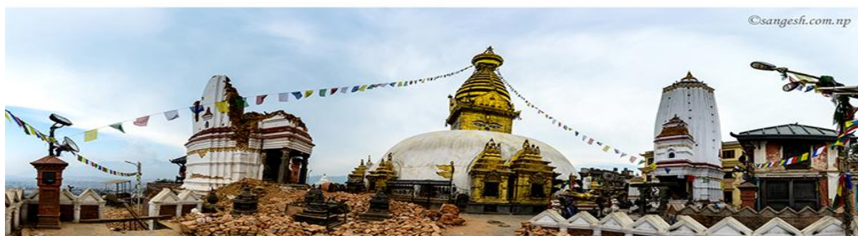
Picture 6; Picture of Swayambhunath Stupa before and after an earthquake