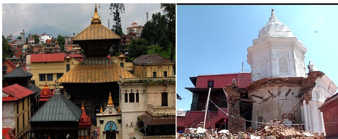
Picture 7; Picture of Pashupatinath Temple before and after an earthquake

The temple of Pashupatinath has not taken any damage and has remained intact during the devastating earthquake. However, minor damages can be seen around the temple which could be renovated. But, the observation can be concluded with no major effects in the area. And, there is no restriction in tourist or visitors access.