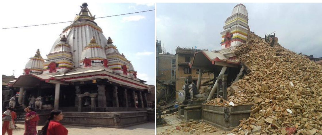
Picture 9, Picture of Machhindranath Temple before and after an Earthquake

Other places such as Dabu Nava mandala, the place to bath Lord machhindra, Mai Rudrayani Kali temple, Karyabinayak temple have remained intact. The tourist activities at these villages have been restricted for certain period of time. 'The Government Officials say, once the work of renovation begins these villages will be once again opened for tourists. However, it is not yet known when these villages will be opened for foreign travelers.' (Explore Himalaya Travel and Tour 2015.)