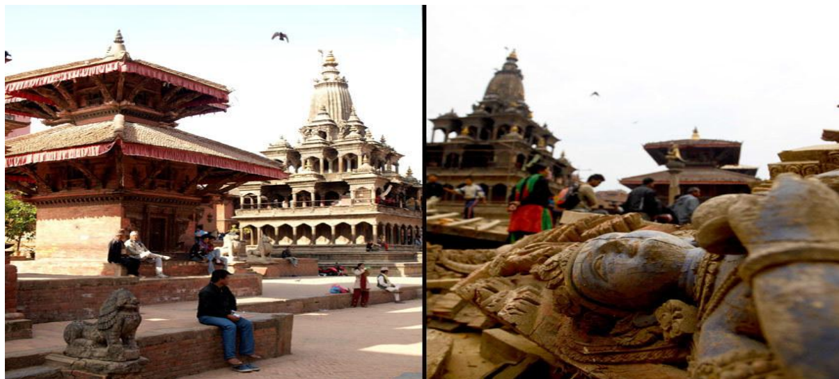
Picture 4; Picture of Patan Durbar Square before and after an earthquake