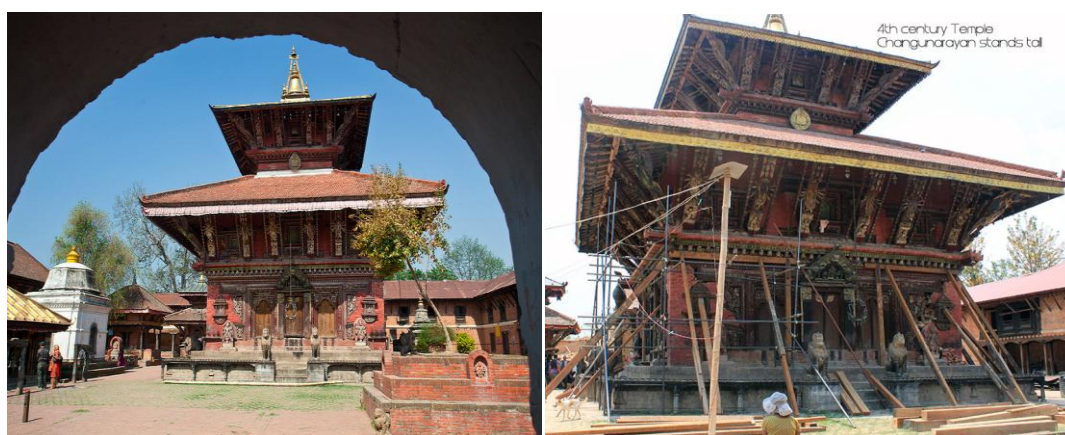
Picture 5; Picture of Changunarayan Temple before and after an earthquake

Although, Changunarayan temple has survived against the trembling earthquake but it has taken some minor damage which has to be renovated. It is one of the oldest temples full with its beautiful art and architecture which should be pass to next generation so that it will not lost its glory in coming future. Presently, the temple along with other side temple is held and supported by the wooden planks until the renovation will not be completed. Also, the temple was closed temporarily for tourist until the renovation is not completed.