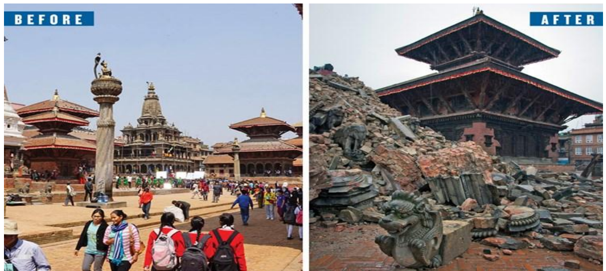
Picture 3; Picture of Bhaktapur Durbar Square before and after the earthquake