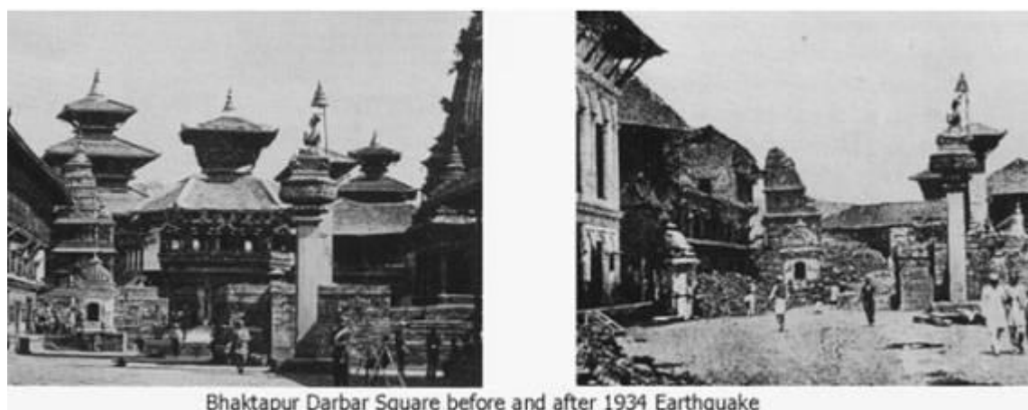
Bhaktapur Darbar Square before and after 1934 Earthquake