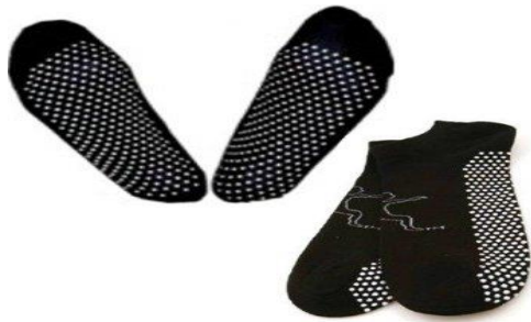
Figure 2. Appropriate footwear

Example of an appropriate home foot wear for elderly with high risk of falls is seen below in Figure 2