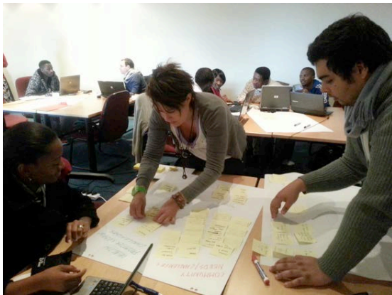
Figure 4. Students in studio mapping out creative process, Cape Town.

Together with each of the four Health Promoters and their communities, student groups collaborated, in order to identify and address their respective sexual health challenges, through a participatory design process. What distinguishes this process is the manner in which the students began to understand the user-as-partner, actively and equally participating, in a co-emergent design process [14] that is strongly situated and contextually and culturally relevant [25]. Participants were exposed to primary user interaction and many noted that their interactions with community members shifted preconceived ideas and initial design solutions. Design solutions were co-created with community members using a variety of tools, which focused on visual storytelling and concept development (Fig. 4 and 5). Community ideas were captured and re-crafted for final presentation.