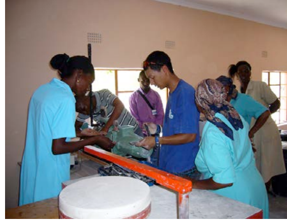
Figure 11. Co-designing with the employees.

As this is a community enterprise, the expectation is that at the end of each financial year, 25% of the profits go to the community. This money is channelled through the Village Development Committee, which oversees all developmental activities in the village. The money is then used to develop other sectors in the village for the benefit of the whole community. Sharing resources with others or less privileged is not something new to Botswana's culture.