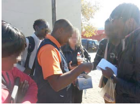
Figure 2. Health Promoter, students and facilitator at a taxi rank, Grabouw.