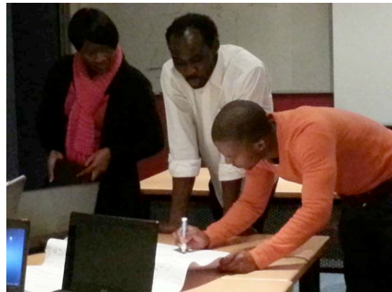
Figure 5. Students in studio mapping out the user journey, Cape Town.