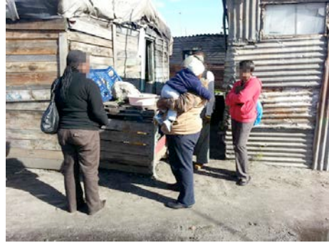
Figure 3. Students with Health Promoter in a township, Grabouw.

The discovery phases included formal lecture sessions and an opportunity for the diverse mix of students to establish a team relationship. This was significant in building a foundation for the one-day community research visit where students were encouraged to engage with members of the community, gather insight and set aside any initial prejudice or assumptions.