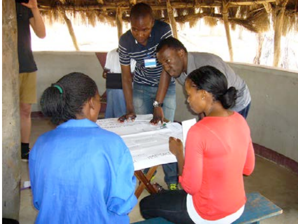
Figure 10. Workshop with the employees.