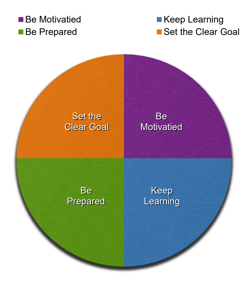
Table 7. Suggestions for future entrepreneurs