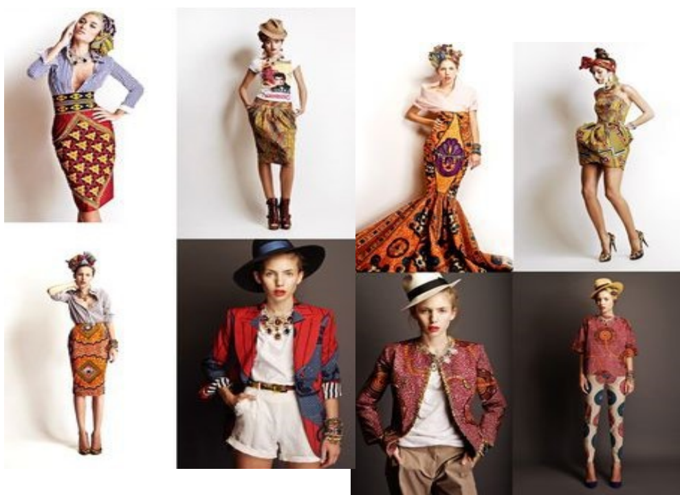
Picture 9. Picture 14: African fashion inspiration (from Style Blog web)

African fashion is another example of a cultural difference. In Africa prints and patterns are seen everywhere. There is a huge variety of colours and lines that can be considered overwhelming. The fashion has evolved and African fashion elements are as well very popular today. Vibrant colours, patterns, colourful matching pieces everything is inspired by Africa. (from Style Blog web)