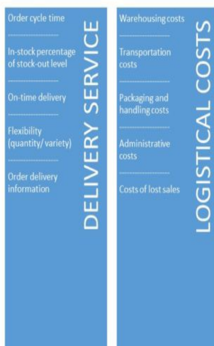
Figure 4. Logistical requirements