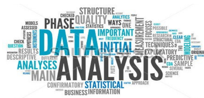
Figure 2. Qualitative data analysis method

The companies will be analysed, according to what and how much information it was able to be gathered from them and other sources. They will be evaluated separately and then a comparison will take place in order to identify similarities and differences between them, and then the combined result and analysis will be presented in the conclusion.