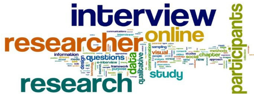
Figure 1. Data gathering measure