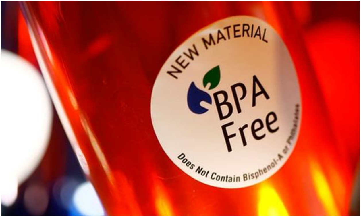
Figure 2: Labelling for BPA free products ( EU moves to restrict hormone-disrupting chemical found in plastics, 2017 )

The Institute of Food Science and Technology ( EU moves to restrict hormone-disrupting chemical found in plastics, 2017 ) has designed a new study on the basis of the evidence which states that use of BPA is strictly prohibited for the products which are produced for infants and in food packaging. In accordance, it is important for the government and food association to create awareness among consumers of the health concerns which are increasing due to use of BPA in regular daily life products.