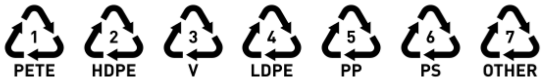
Figure 1. Recycling codes of different type of plastic. ( the Society of the Plastics Industry, 1988 )

Today, BPA is used for making several goods for everyday needs such as water bottles, cans and compact disk. It is also used for the coating on food utensils. For maintaining food safety, it has been tested for years for determining its suitability. Specifically speaking, BPA is used for storage containers to maintain freshness of food and water ( McGrath and et.al., 2017 ). The packaging of plastics has been divided into seven different categories for categories from 1 to 6 are not likely to contain of BPA whereas the category 7 is made with BPA and has a resin identification code 7 which denotes its content and form of plastic (Figure 1).