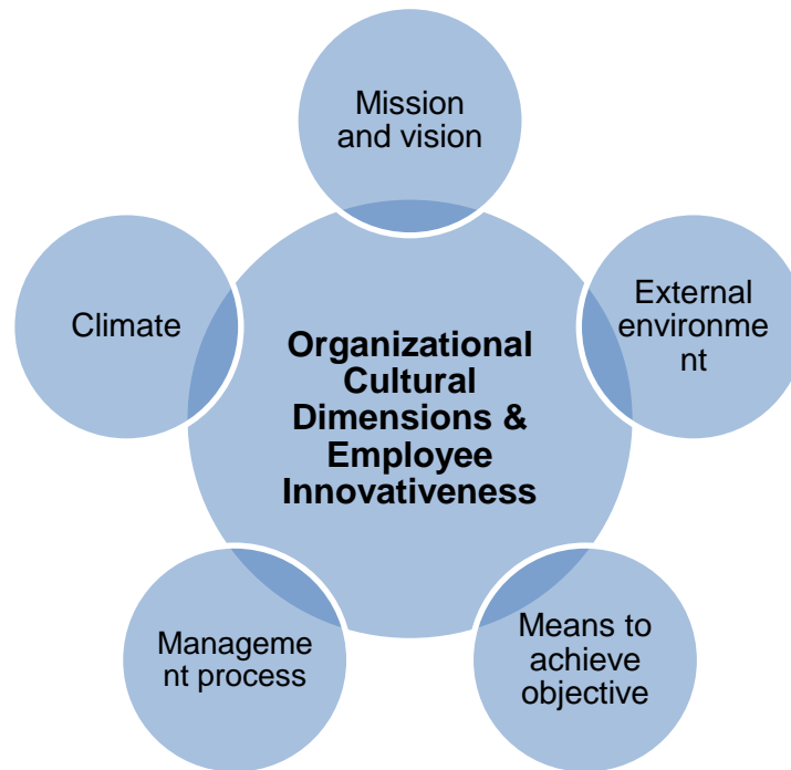
Figure 2. The newly-established framework of organizational culture dimensions

(e.g. work environment, communication, interpersonal relationships, collaboration and trust).