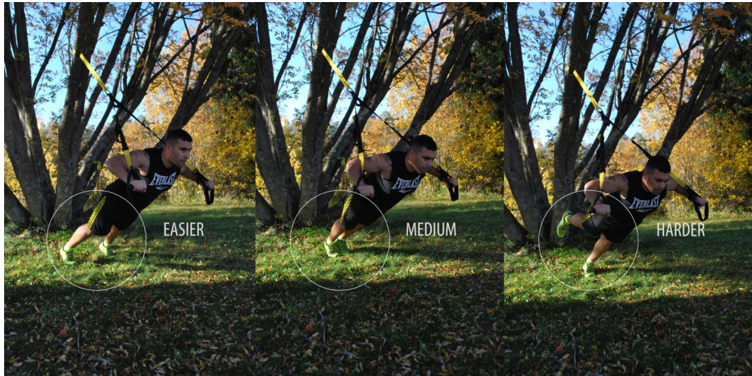
Figure 2. Stability Principle (Monje Morales 2018.)