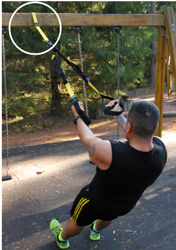
Figure 1. Single point of attachment. (Monje Morales 2018.)

a door frame, tree branch etc. also, the single point of attachment allows easy adjustability. Having a single point of attachment allows the user to perform exercises with a ROM and with more control over the movements. (Bettendorf 2010, 15.)