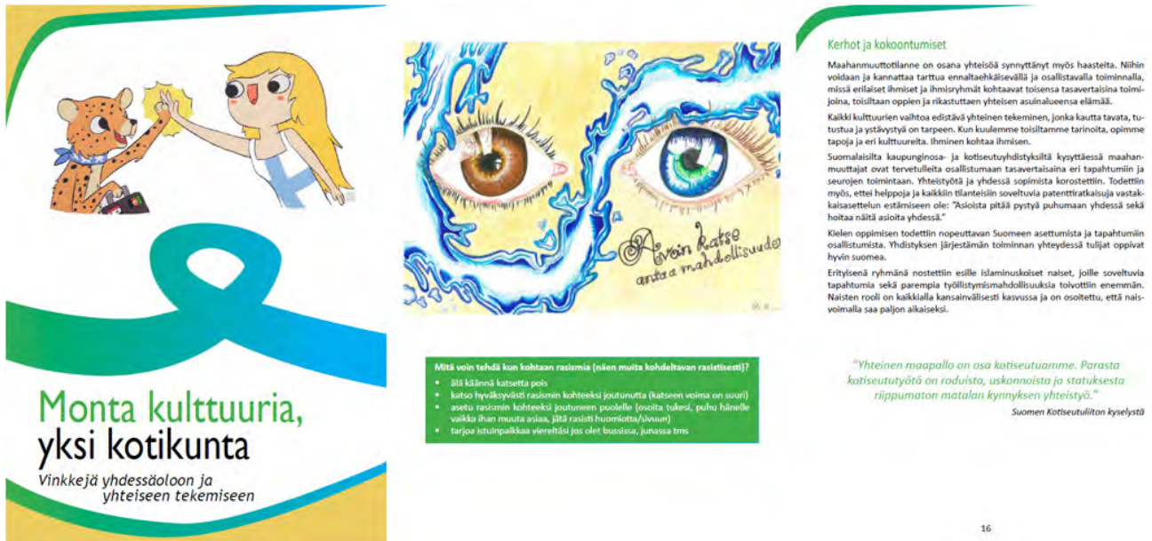
Figure 3: Example pages (cover; p. 7; p. 16) from the co-created handbook publication Many Cultures (Ruoslahti, et al., 2017)

ing people together, clubs and gatherings, the role of community associations, and a list of tips and solutions.