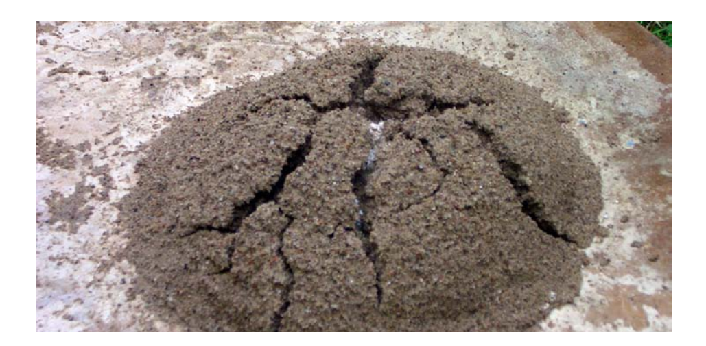
Figure 9 . The burned lime is reacting with the added moisture. It expands to double its volume and releases heat.

When the reaction was over we started mixing. By adding some more water we made the render into an even and smooth paste.