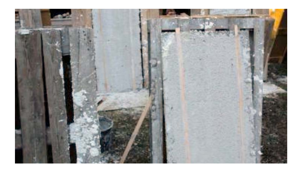
Figure 14. Creating an even surface by using two strips of wood as guide.

We used two wooden strips as guides as we practiced making an even surface.