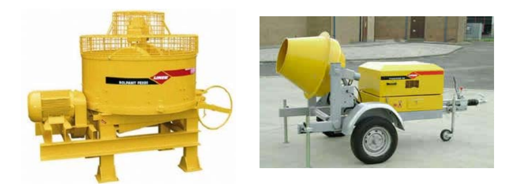
Figure 2 . Roller pan mortar mill and tombola (model: Multi–marque / Liner). http://www.multi-marque.co.uk/products.asp (fetched: March 1, 2011).

You can mix the render using two types of machines: roller pan mortar mill or tombola. The roller pan mortar mill is suitable for mixing both dry and wet slaked lime. When mixing fat renders and lime putty the roller pan mortar mill is an excellent choice, due to its ability to mix very homogeneous mortars or renders. Dry slaked lime can be mixed with a tombola. The workability of the render depends on the mixing time.