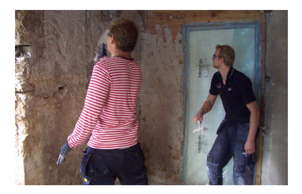
Figure 3 . Students of structural engineering are busy learning the technique with best materials on masonry to the left and on wood to the right.

The frost resistance does not depend only on which binder—cement or lime—is used. Instead, the result depends on the mixture of binder(s), sand and water as a whole. Finally, the most important aspect is the craftsmanship. Even the best materials cannot compensate bad work. (Balksten 2007)