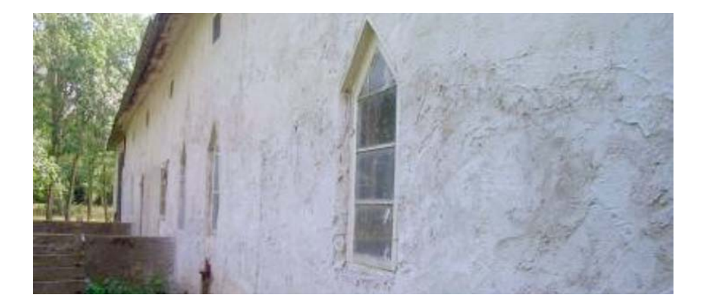
Figure 16 . The facade with patches of student work.

One of our main assignments was to render an elevation of a stable with lime–cement–mortar.