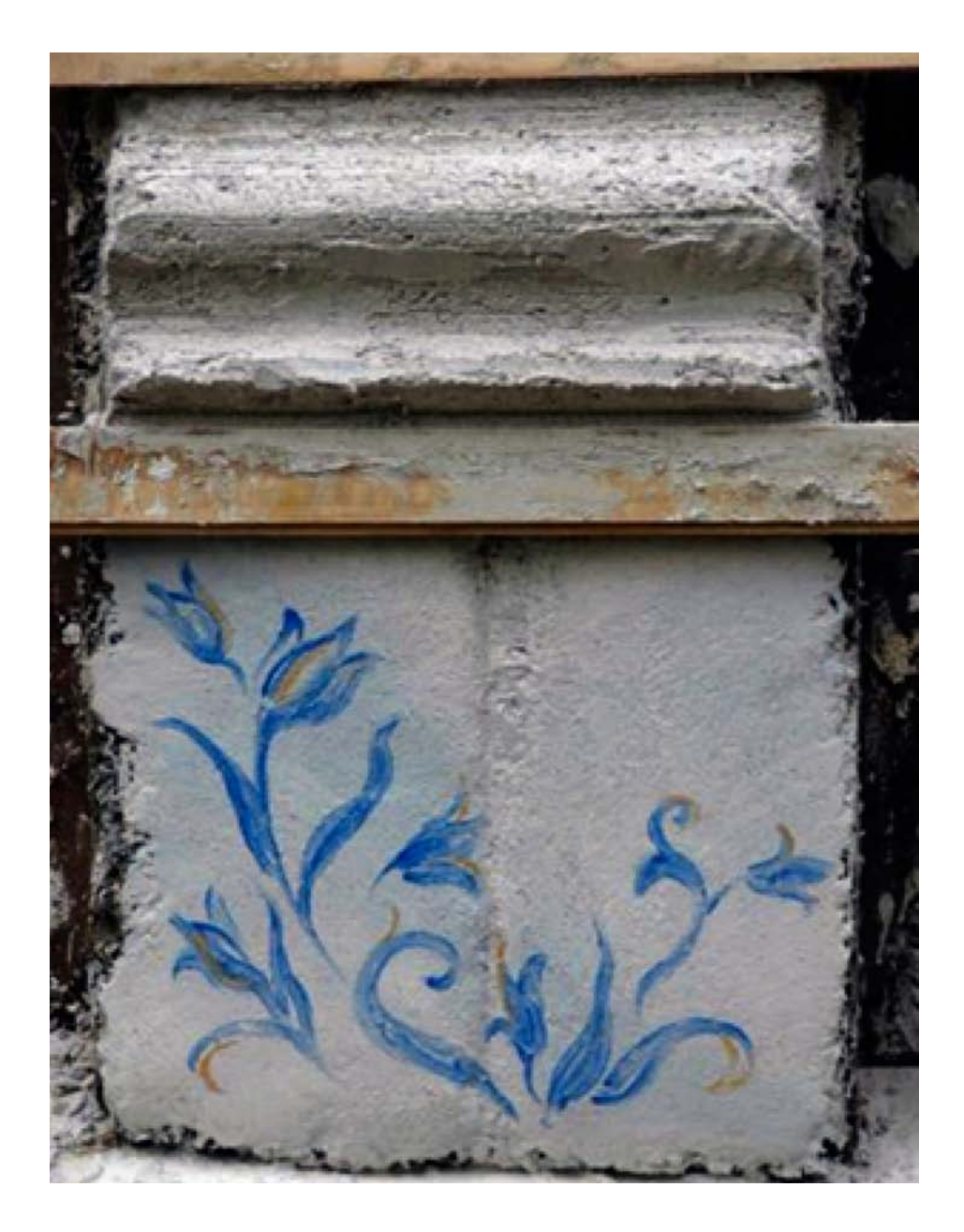
Figure 5 . Lime wash can also be used for decorative purposes. This little experiment was made by one of the students in al secco technique on dry plaster.