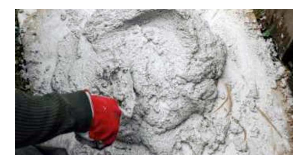
Figure 10 . Mixing hot lime by hand.

When the reaction was over we started mixing. By adding some more water we made the render into an even and smooth paste.