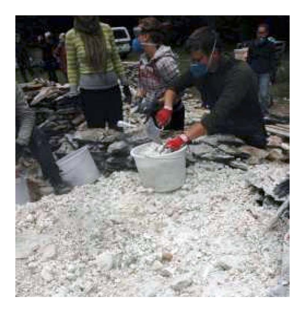
Figure 6. Emptying the lime kiln and sorting out the lime.

It is very important to use good protection of lungs, eyes and skin because burned lime stone, or calcium oxide is highly alkaline with a pH–value =14.