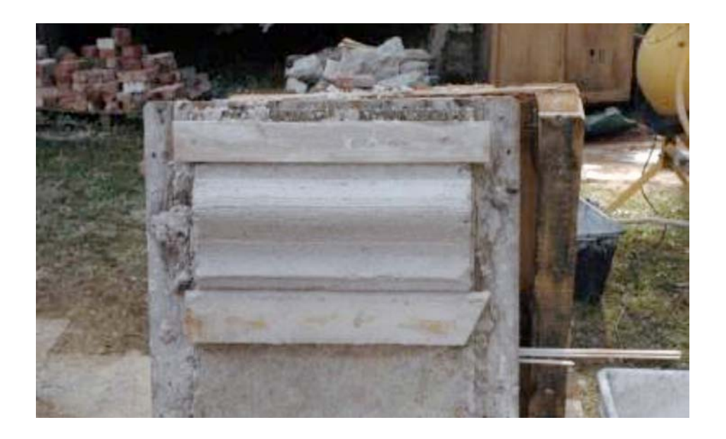
Figure 15. Moulding the surface by using a stencil.