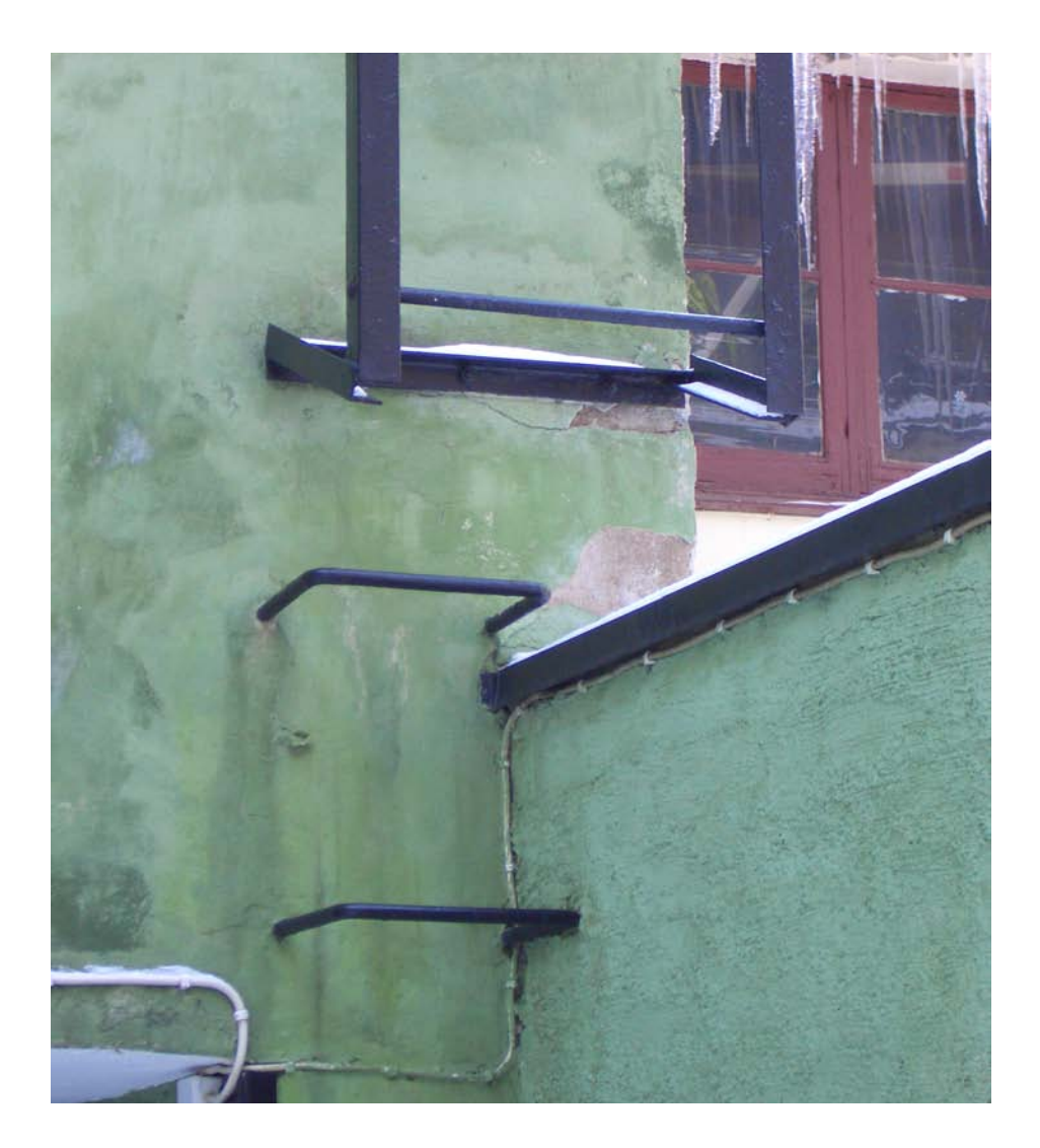
Figure 4 . Multiple problems on both rendering and lime wash caused by bad detailing, rain and frost.

the plaster to breathe, i.e. do not allow moisture to pass through, will sooner or later result in frost damages. In cities smog can cause similar problems as the wrong kind of paint. This makes it important to wash the walls from time to time, and particularly before they are given a new coat of lime wash. Traditional lime wash is a good choice as long as it is protected from local runoff of rain water.