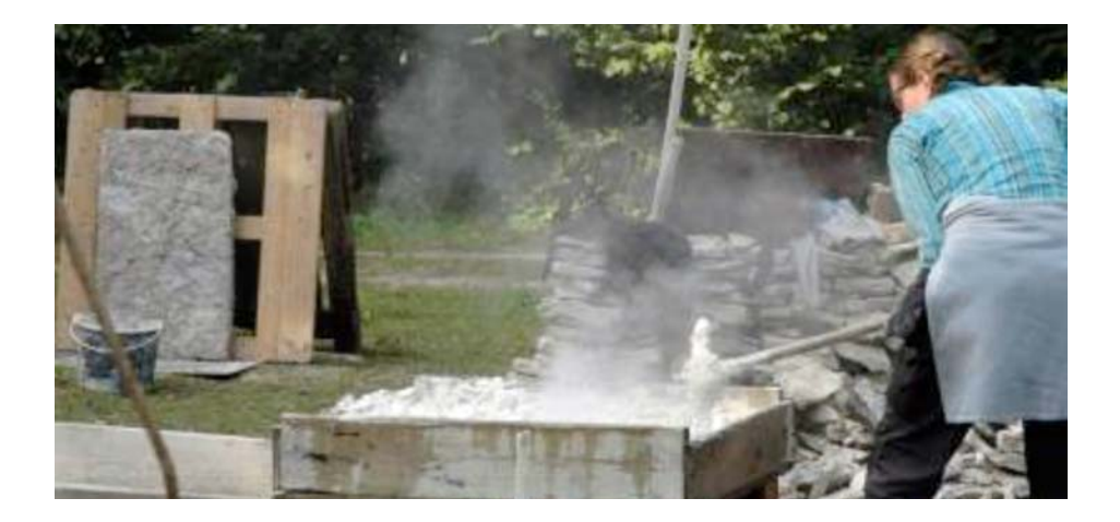
Figure 11 . Wet slaking. Kristin Balksten in action.

We made larger quantities of lime putty by wet slaking, in wooden crates which were built according to a 19th century model.