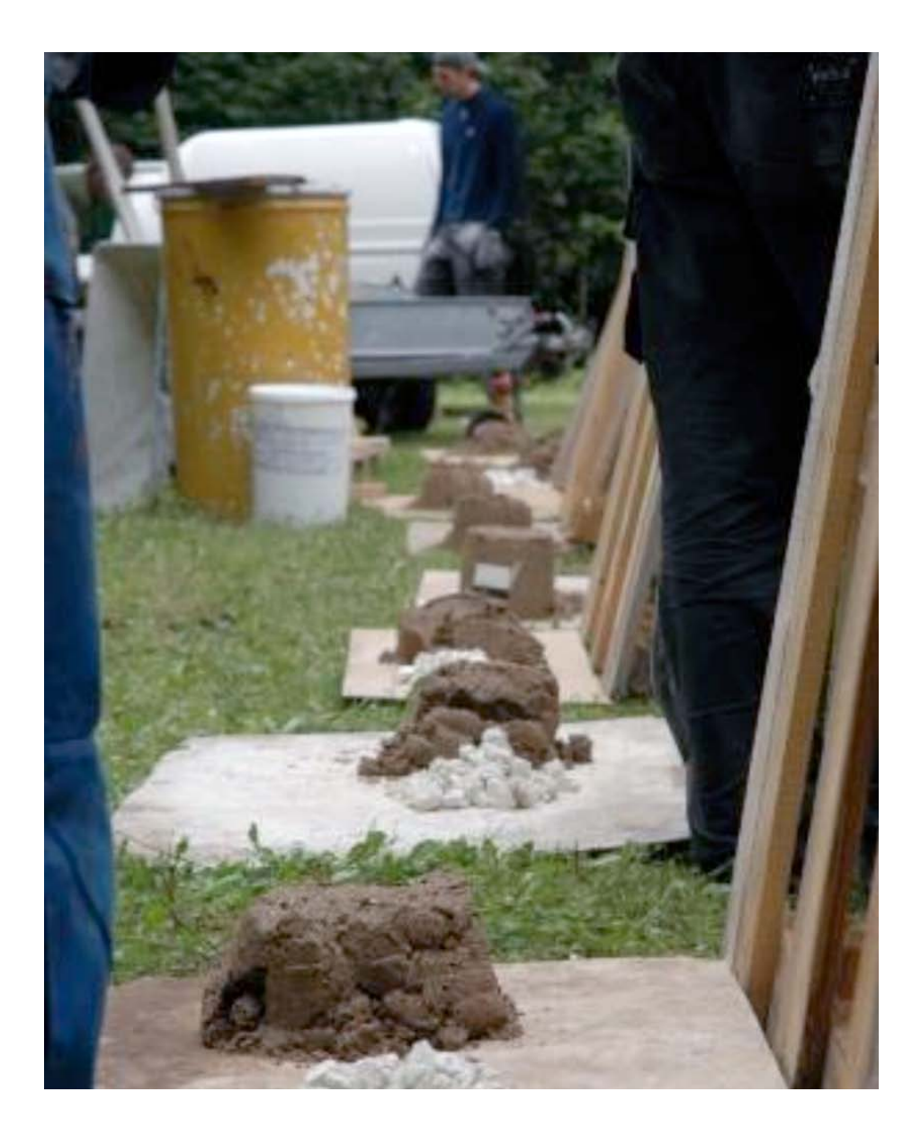
Figure 8. Hot lime ingredients: sand and lime from the lime kiln.

When the lime was sorted, we started making hot lime. We picked out a small bucket of the purest lime stones (1/5) and sand (4/5). The sand was then piled over the stones. Finally we added slowly water on top of it all and waited for the burned stone, i.e. calcium oxide, to react.