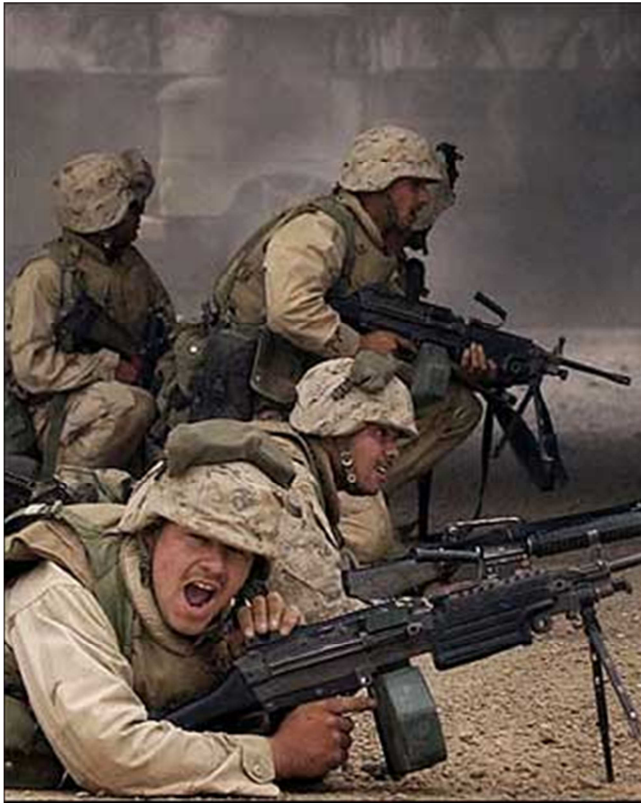
Picture 2: Iraq battle field ([Referred to 30.6.2010]).