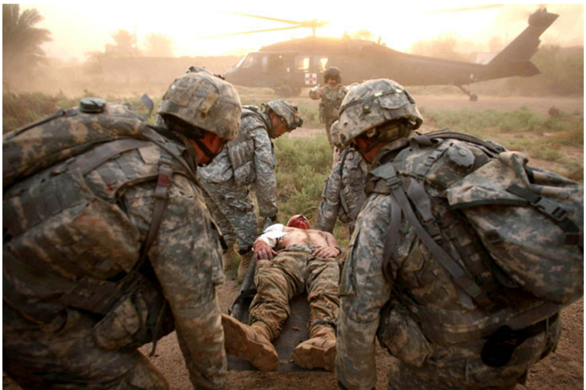
Picture 3: Witness of the death and injury.