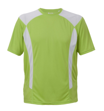
FIGURE 3. A-code cool dry-t-shirt

Camelbak brand is well known for their high quality products and High Peak sells them to the customers as customized products. Companies can get their logos for the products, which makes them unique and same time company can be shown in the products. In the figure 5, is a Better Bottle named Camelbak water bottle that can be offered in the fitness campaign. There are also many different types and sizes of Camelbak bottles, such as insulated water bottles, sport bottles and metal bottles which keeps the water cold for hours.