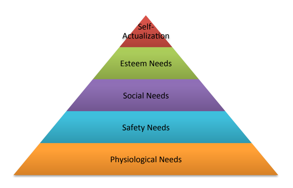
FIGURE 2. Maslow's hierarchy of needs (Maslow's Hierarchy of Needs Chart 2011)

The McClelland's theory focuses on three human needs, which according to this theory are the needs that make humans motivated.