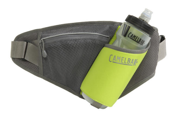
FIGURE 5: Camelbak water bottle strap

The products in category three are of higher value, closer to 100 Euros or more and most likely companies will choose these product gifts to give to their employees as a reward for the overall campaign when the campaign is over. Some companies may choose to reward some people with these more valuable gifts, if the employees have gone beyond the goals. Some employees may have the goal of five hours per week, but they could constantly go over the hours and that is when the employee could choose to reward the employee on the success.