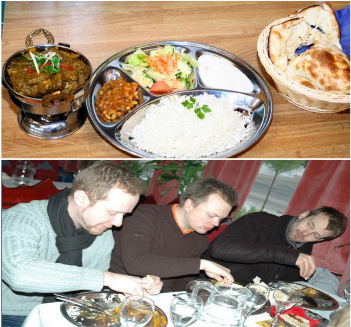
Figure 12: comparison website pictures of Yeti Nepal and rival Mt. Everest.

One of the famous restaurants and its major competitor Mt. Everest's website looks better than that of Yeti Nepal. It has posted several pictures of its customers eating and enjoying in restaurant. Though, Mt. Everest has not made its brand positioning based on multicultural environment, but its website provides a good inspiration for anyone that wants to highlight its multicultural aspect.