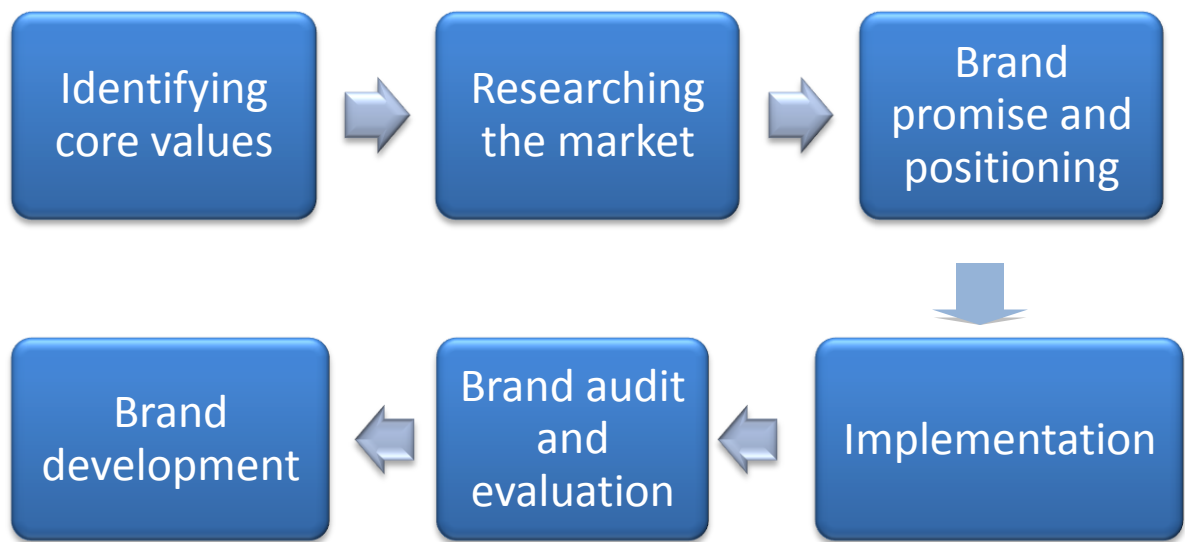
Figure 9: Steps of strategic brand creation based on Ropo juha pekka and 'Brands and branding'