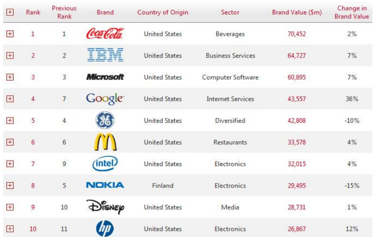
Figure 1: World's top ten brands. (Interbrand, 2011)

Today's brand scenario has totally changed from the Roman idea of a brand. A company's success is measured on the brand's value in the market. True value of a strong brand is its ability to capture consumer's preference and loyalty. Big corporations are taking part in the race to become the top brand. As the rank of a brand goes up, the price of its share also rises. Coca cola from the United States is the strongest brand on earth. Its brand value is worth $70,452 million.