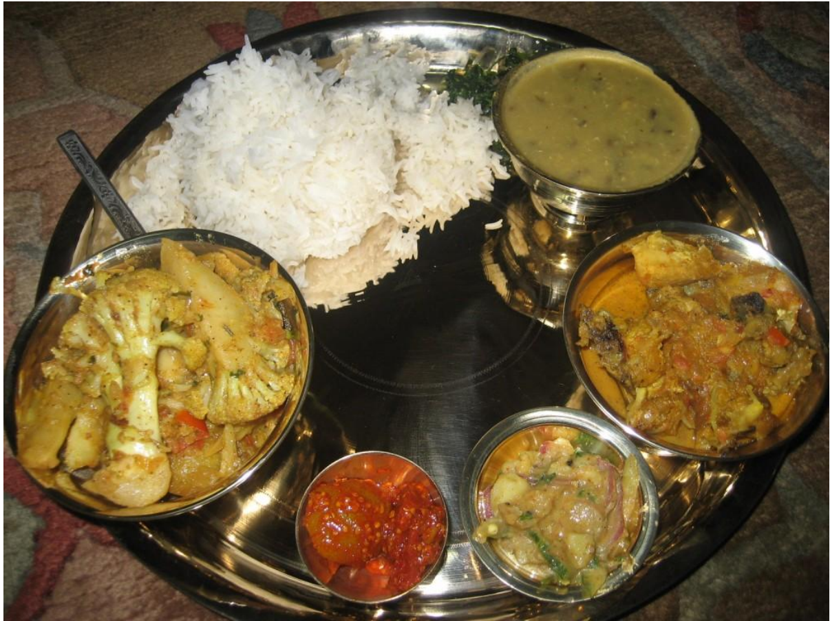
Figure 7: Nepalese food set Daal-Bhat.