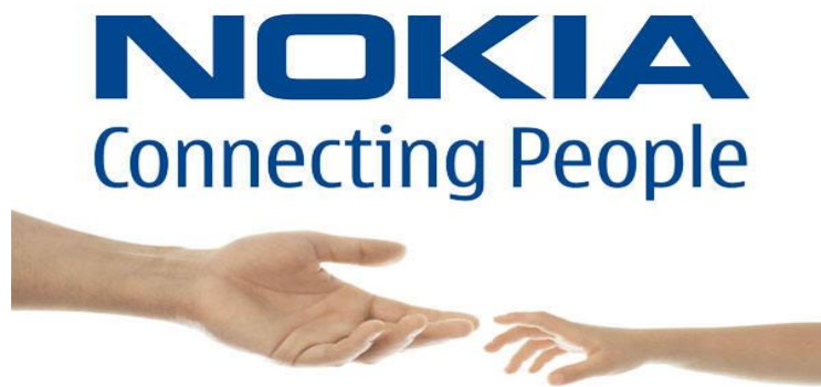
Figure 4: Slogan of Nokia. (Ayaanonline)

Once the brand is formed, it should be communicated internally and externally. Internal communication is necessary because if the employees, the stakeholders, the agents and the representatives are well aware about the brand promise, enthusiasm creates positive impact which then accelerates the performance to deliver the benefits. External communication exposing the brand promise hits customers' nerves and appeals him/her to buy the product. If they are satisfied with the benefits, there are chances that they will turn into loyal customer.