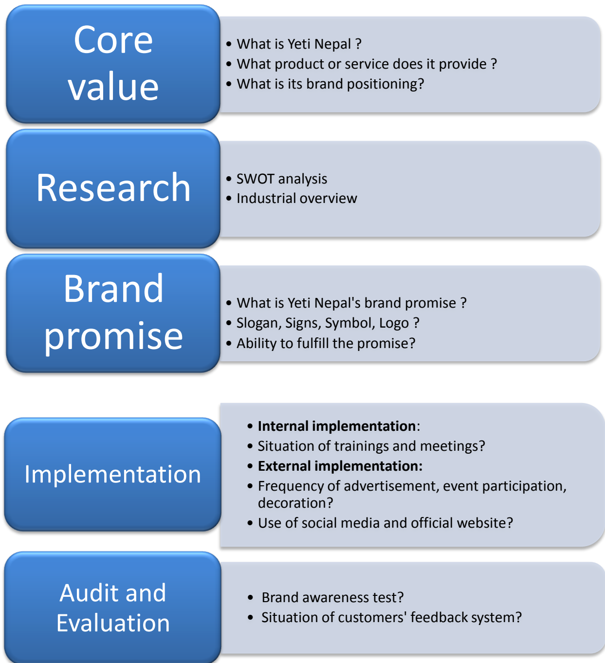
Figure 6: Interview's key questions.