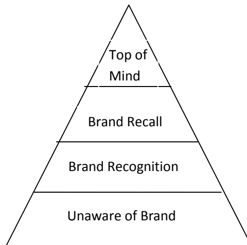
Figure 2: The awareness Pyramid (Aaker, 1991, p62)

Brand awareness pyramid is the hierarchy of brand in the minds of potential buyers. A brand falls in the lowest level if the potential buyers are totally unaware of it. Brand recognition is minimal level of brand awareness. Out of given set of product classes and brand names, if the respondents answer that they have heard it before, the brand falls in this stage. And to be stronger than this level if they are able to remember it without the help of product class/ brand set, the brand goes in Brand Recall level. On the top of hierarchy, mostly repeated brand name exists. The logic behind recognition of a brand name is as follows: