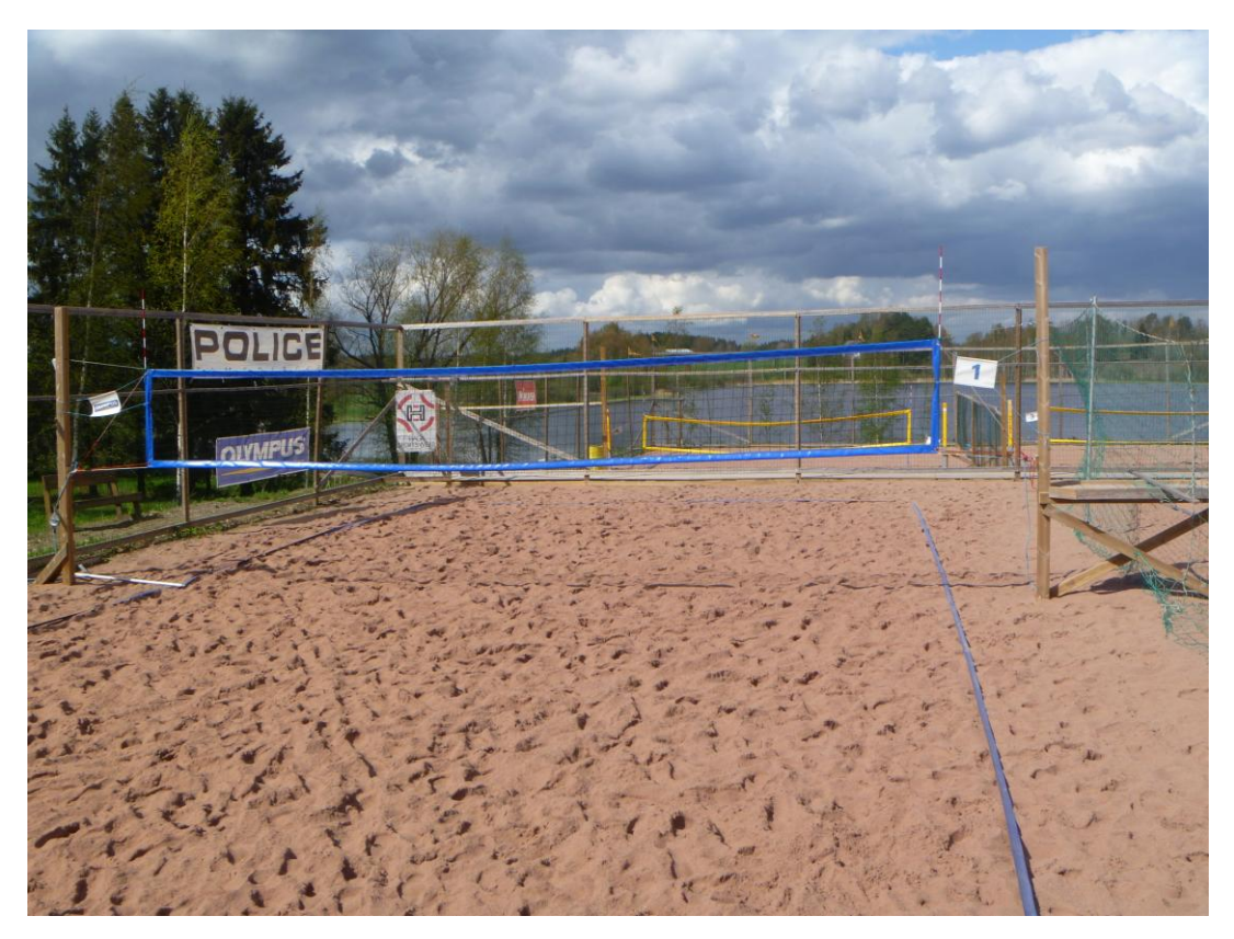
Figure 1: Beach volleyball courts at Hyynilä