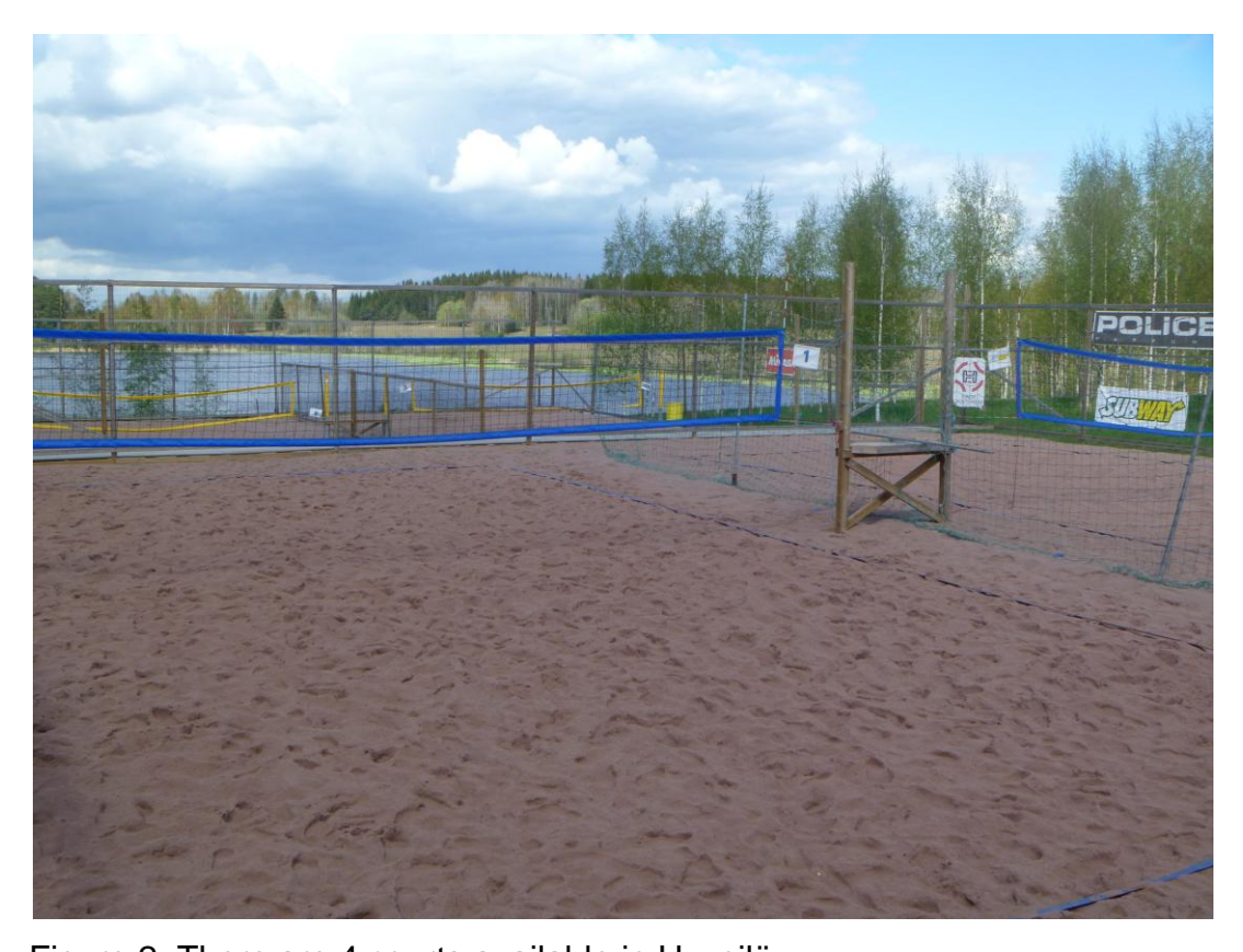
Figure 2: There are 4 courts available in Hyynilä