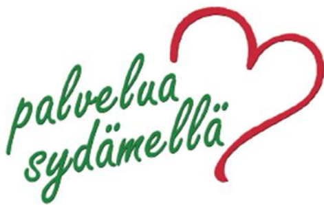
Figure 3. Service from the Heart logo (Rural Policy Committee 2007, 1.)

The service from the heart training provides the participating companies with knowledge how to build competitive advantage through satisfied customers. This kind of learning is especially important for small and medium sized businesses in the ever accelerating competitive tourism environment. (Rural Policy Committee 2007, 2.)