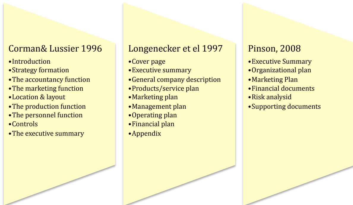
Figure 1: Business plan content examples

In the following figure (Figure 1) introduced are three examples of business plans content.