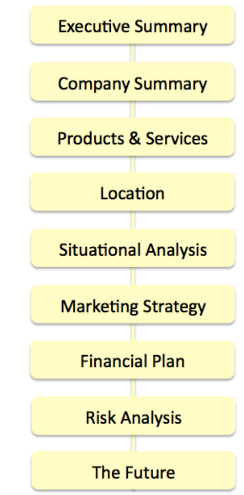
Figure 2: The Dairy Business plan content

The content of the business plan for ‘The Dairy’ (Figure 2) was constructed by combining elements from the resources mentioned above.