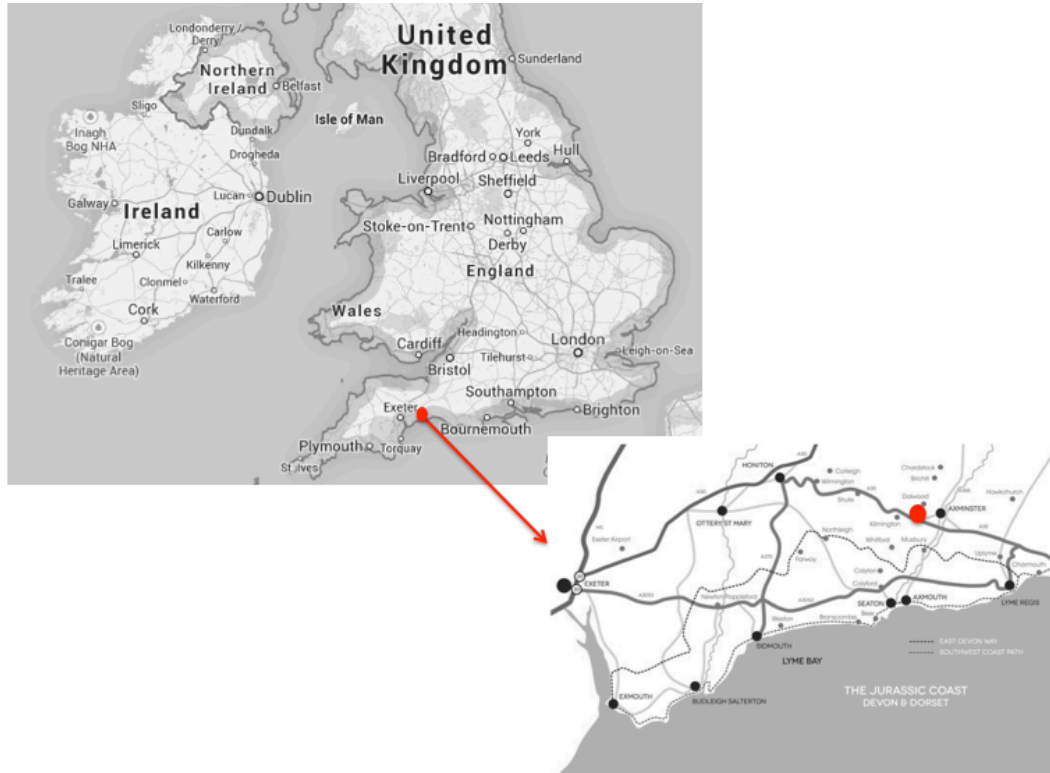
Figure 3: Location of the Dairy

Within the surrounding areas of the Dairy there is an abundance of quality eateries. A magnificently stocked Farm Shop selling locally sourced organic products is only a stones throw away (1km).