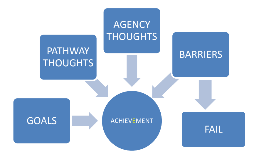
FIGURE 1. Components of the Hope theory (Snyder 2000, 9-10)