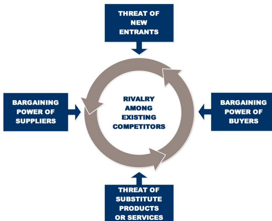
Figure 1. The five forces of competition.

Rivalry among existing companies indicates that the rivalry is more likely to be aggressive when the following characteristics appear: the high number of competitors, high quality standards, low market growth or high exit barriers (Figure 1).