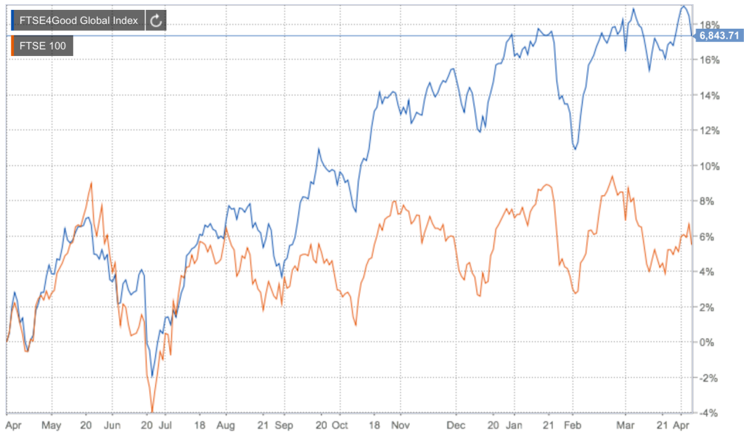
Figure 3: FTSE 100 vs. FTSE4Good 2013-2014