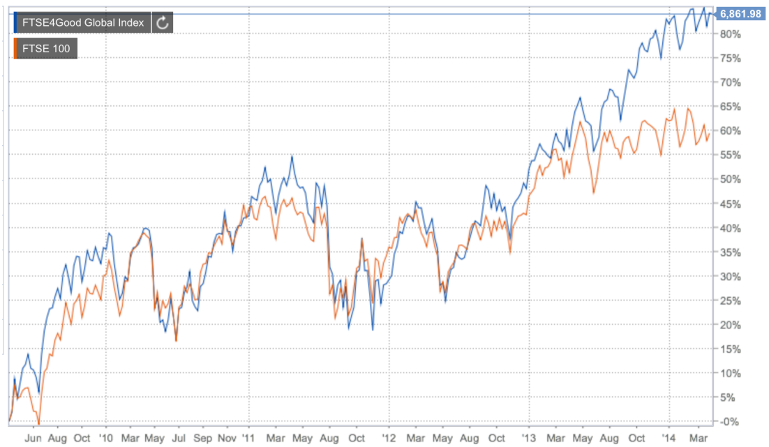
Figure 4: FTSE 100 vs. FTSE4Good 2009-2014

It also seems that the answer for the question whether the conventional fund is more profitable than ethical fund, is negative. On the figure 4, the conventional and SRI funds have been compared over the past five years. The figure shows that there is no