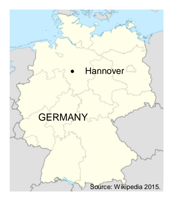
Figure 2. Hannover on the map of Germany.

Over 20 years Hannover has regularly published environmental reports showing the sustainability level of the city region. The reports illustrate the development of the city performance and evaluate the realization of the environmental policy targets. Measuring the city region's sustainability with different indicators provide a truthful basis for political decision-making, and also give a tool to monitor their success. (Landeshaupstadt Hannover 2012, 4.)