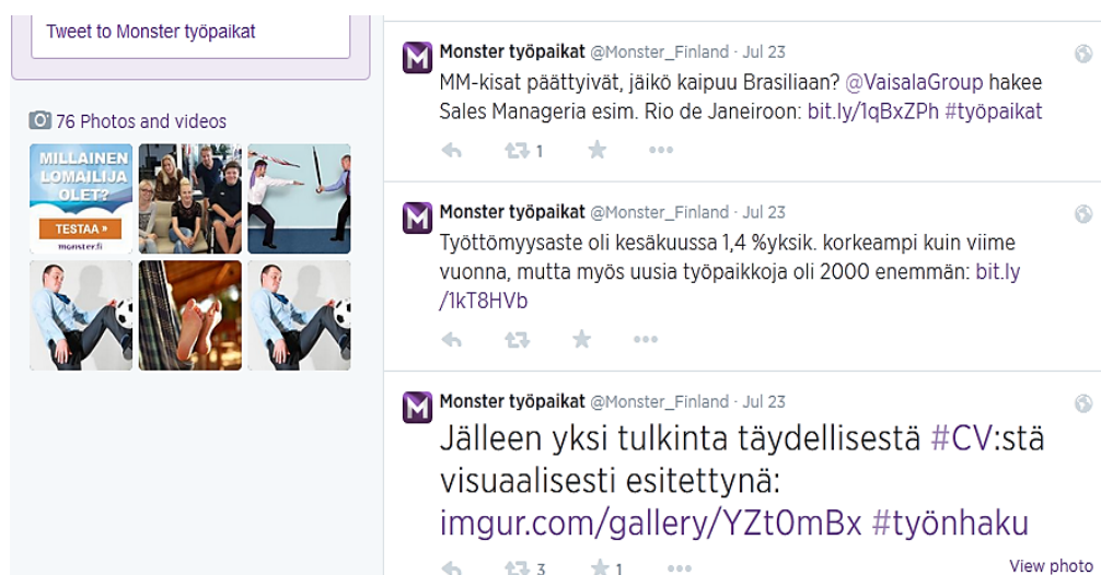
Figure 3. The Twitter profile of Monster Finland (Twitter 2014e.)