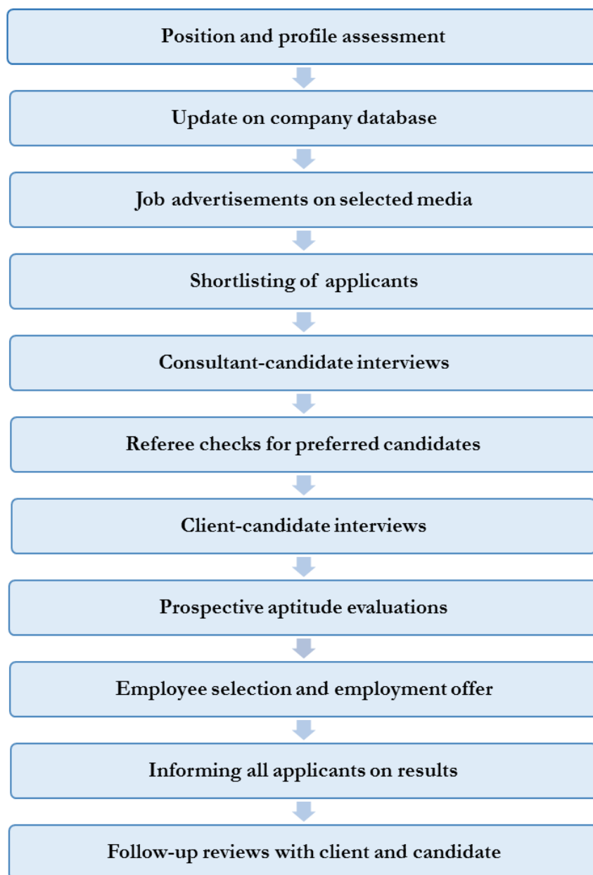
Figure 2. The recruitment process of Temp-Team (Temp-Team e.)

evaluations are required, they are arranged after the client-candidate interviews. The personality tests provided, WOPI and Cut-e, emphasize applicants' self-image and they measure particularly the competences necessary in work life. Projective psychological tests, such as the Rorschach inkblot test, are never used for candidate evaluation. When the client has interviewed the chosen candidates and made the final decision, all applicants are contacted in order to provide information on the results. Afterwards, the Recruitment Consultant monitors the success of the recruitment by discussing with the hired employee and the client company. Adapted summary of the overall recruitment process of Temp-Team is presented in Figure 2. (Kangas, M. 4 Feb 2014; Temp-Team d; Temp-Team e.)