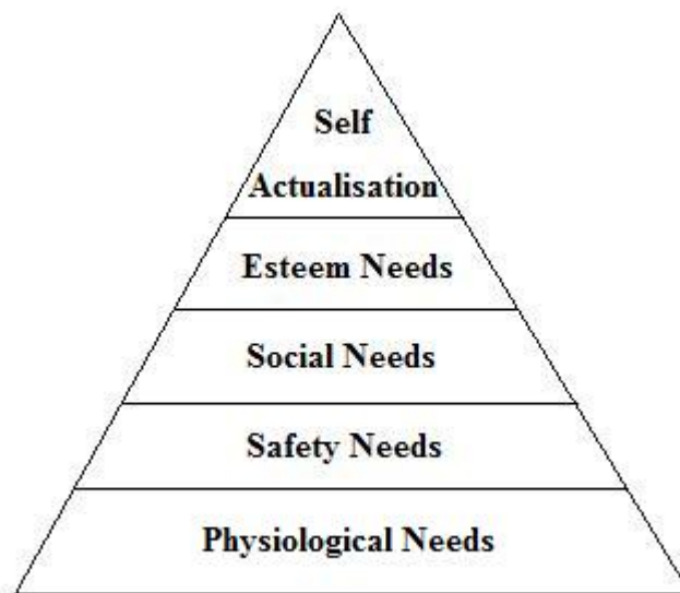
GRAPH 1. Maslow's hierarchy of needs (adapted from the website of Abraham Maslow. http://www.abraham-maslow.com/m_motivation/Hierarchy_of_Needs.asp )

These layers are strongly connected to each other; one cannot exist without the other. They built on each other, so it starts from the bottom. The first two levels are considered the basic level, which represents the basic needs.