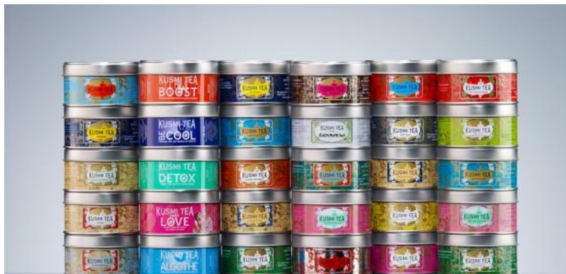
Fig.3 represents a large part of the Kusmi tea collection in its famous multicolored hip caddies.