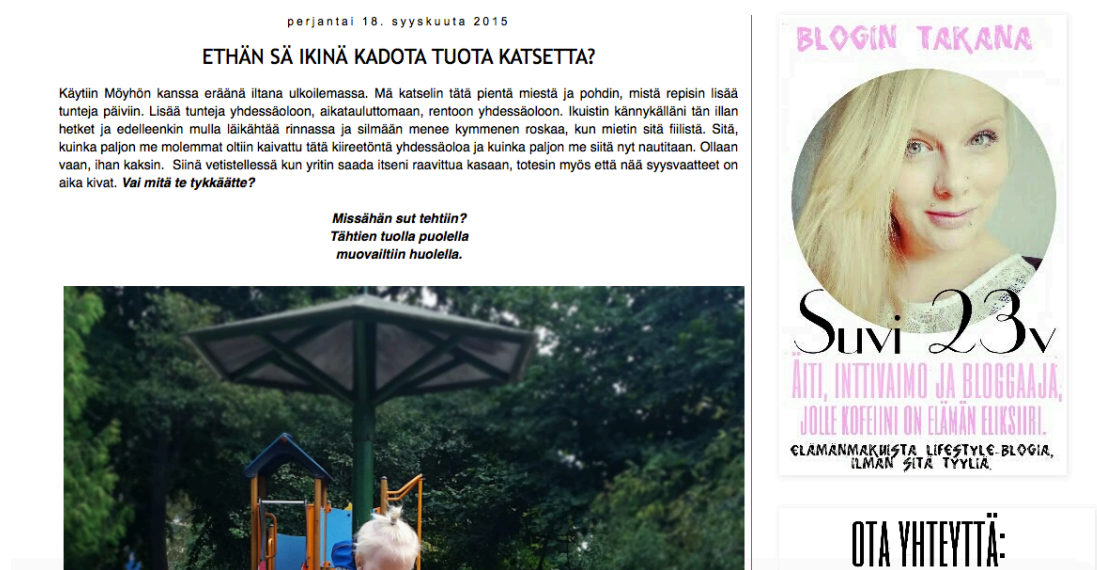
Picture 1 Example of a Blogger.com -based blog

Blogger is a free and easy-to-use blogging platform owned by Google. It has a clean design and a variety of ready-made templates for users to choose from. Many users value the fact that they do not have to be experts in HTML-coding in order to set up a nice blog. One of the participating blogs was published under blogger.com. (See picture 1)