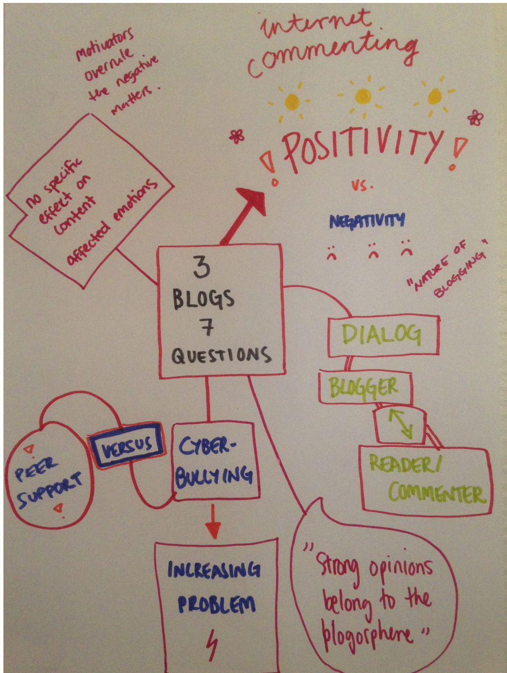
Appendice 1. Semantic Map of the Results