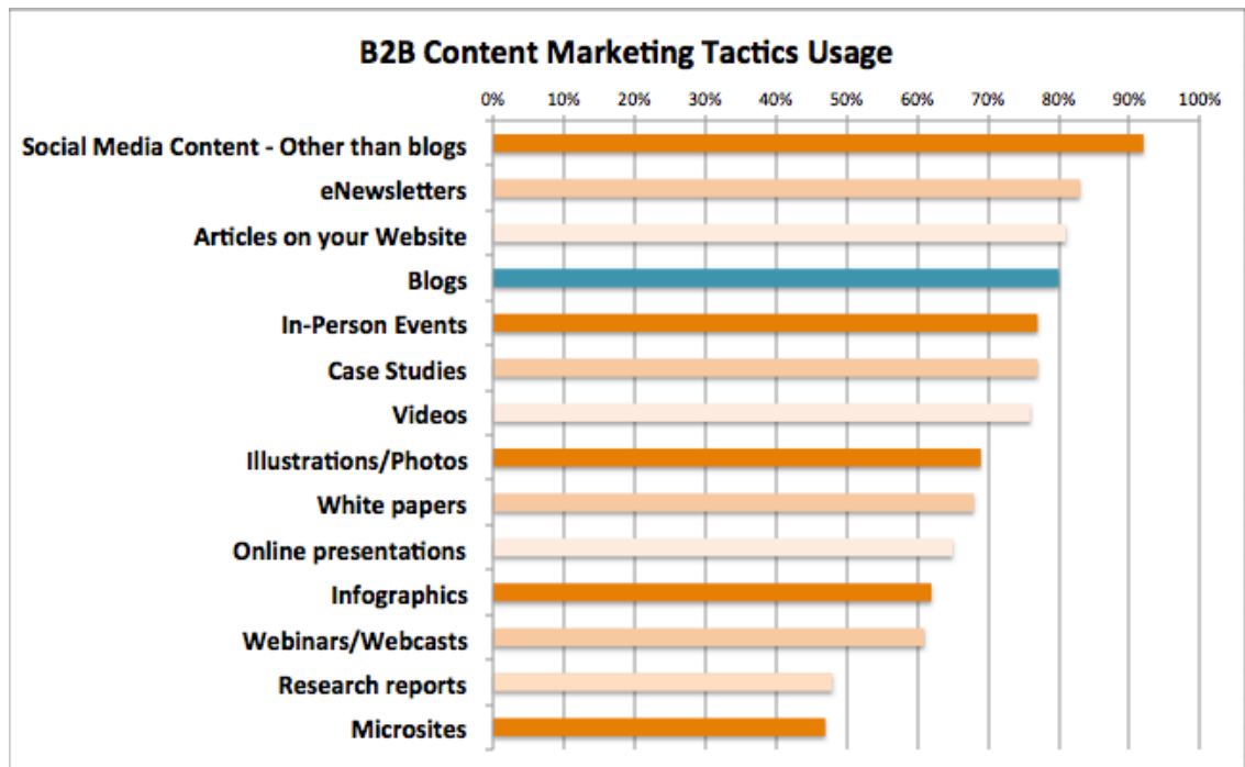
Figure 2 - B2B Content Marketing Trends 2015 (Adapted from Pulizzi, J. & Richie, A. 2015)

This figure is not surprising as there are multiple reasons why everyone building their own business and brand should at least consider launching a blog. According to Pulizzi and Ritchie (2012), a blog is not only an inexpensive marketing tool but can also work as a magnet for customers. By actively updating a company's blog, the company provides content for their customers to converse and discuss on other social media platforms. This easily forms bonds between the customer and the business because blogs work as 24/7 communication platforms as well as support numerous different content formats such as audio, video and PDF's. Furthermore, blogs provide direct and factual metrics for companies to monitor their marketing activities, which is naturally an important factor with any marketing effort.