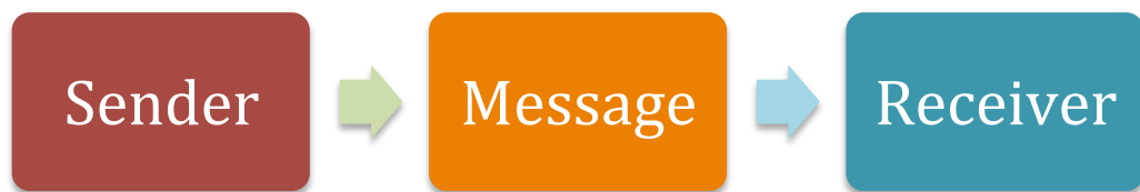
Figure 1 - Communication Model

The Merriam-Webster Dictionary (2015) defines communication as "the act or process of using words, sounds, signs, or behaviors to express or exchange information or to express your ideas, thoughts, feelings, etc to someone else" . (2015) The core idea of communication can be defined as a chain of a sender, a message and a receiver, usually represented as in Figure 1 below. The message is the most essential part of communication, and in order to travel, it needs a sender to first encode the message and to send it forward – and then a receiver to receive and decode it.