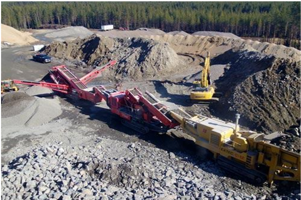
Figure 2. Extraction of aggregates in Finland [12]

Habert and Roussel suggest that the biggest threat to the concrete industry is the depletion of aggregates surrounding the developed areas, whereas worldwide depletion is not a concern. Their studies estimate that the price of RA doubles for every 30km of distance that the product has to be transported. [11.] Since aggregates are of very bulk size and weight, CO 2 emissions from transportation leave an immense carbon footprint behind.