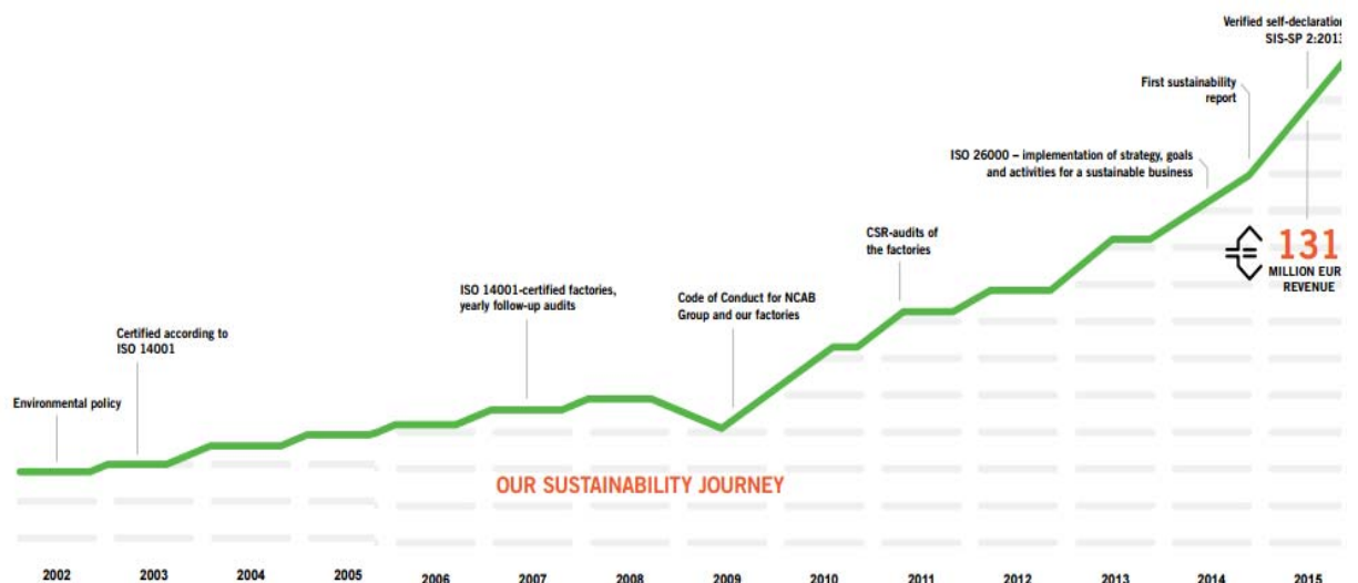
Picture 1: NCAB Group sustainability journey until 2016 (NCAB sustainability report 2015)

The global world faces several environmental and social challenges and NCAB wants to be part of the solution; quality and environmental management has been important to the NCAB Group for many years. This can be clearly seen in company's values, effort and acts towards CSR. Here below (PICTURE 1) you can see their sustainability journey all the way from the beginning the environmental policy was set in 2002 until today where NCAB has developed its work towards more sustainability business.