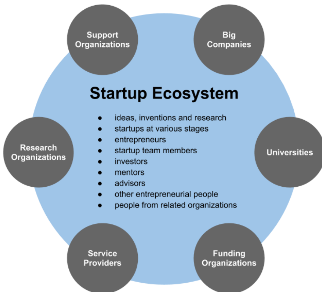
Figure 2: The Domains of the Entrepreneur Ecosystem

Smart entrepreneur understands the importance of healthy interaction with other stakeholders in entrepreneurial ecosystem, as it increases the productivity of companies in the area, drives innovation and stimulates the formation of a new business. There is different objective that motivates all the actors, for public officials, is job creation and tax revenues. For financial institutions, is profitable loan portfolio. For a university, it knowledge generation, reputable and endowments. For corporations, innovation, product acquisition, talent retention and for entrepreneurs and investors, wealth creation and actualization of self- determined goals.