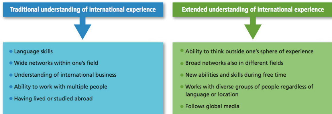
Figure 2. Traditional and Extended Understanding of International Experience (Hidden Competencies 2014, 21)

International competence has traditionally been associated with language skills, studying or working abroad and willingness to travel. However, the competence is much more than that. An internationally competent person also has abilities connected with creativity, networking and interest in new things as shown in Figure 2. The international competence can also be developed in hobbies and in free time. (Hidden Competencies 2014, 21–22.)