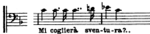
Figure 7. "Mi coglierà sventura" Act 1 scene VIII, bar 65-66.