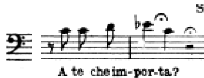
Figure 8. "A te che importa?" Act 1 scene IX, bar 115-116.