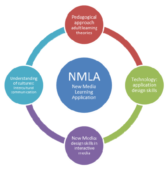
Figure 1: The framework of IECEU NMLA (IECEU, 2017, D5.2)

The IECEU NMLA offers a complimentary tool to enhance the knowledge of a broad end-user audience on themes related to selected crisis case studies and crisis management decision making and planning. The term new media was used to differentiate between old media (print press, TV, radio) and the new information technology based media. The learning content is also supported by the social media and rich digital contents as selected algorithms. These algorithms often include interactive elements and possibility to communicate and provide feedback. Examples of new media include websites, games, augmented reality, multimedia and various learning platforms. (IECEU, 2017, D5.2). This also because in spite of the presented benefits Eearning can provide to various training, "digital tools do not substitute face-to-face methods, but complement them by enabling more constant interaction with users and lowering certain users' participation thresholds." (Friedrich, 2013).