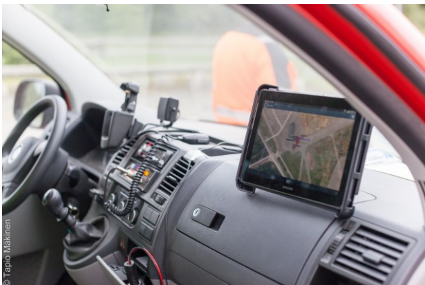
Fig. 4 Smartphone installation on fire truck