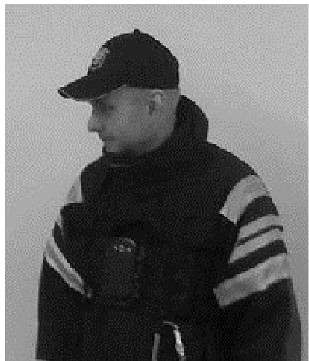
Fig. 2 Smartphone installation on fireman's uniform

Situational awareness system of Eye Solutions and reliable communication through Ajeco's 4Com router were tested in the camp. They were also