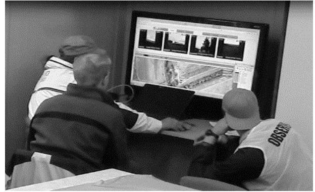
Fig. 5 Viksu 2014 camp's command and control room