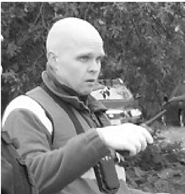
Fig. 3 Smartphone installation on paramedic's uniform

available during the scenario exercise. In the Viksu 2014 camp, Samsung Xcover Android smartphones were used. Their installations on the rescue workers uniforms were made so that smartphones' cameras could take real-time video (see Fig. 2 and Fig. 3). One mobile command and control system was installed on the dashboard of a fire truck, as shown in Fig. 4. Within the "natural disaster" there were one to three observers in the command and control management room (see Fig. 5). Real-time picture was seen on the screens in the command and control room. Operations in the control room were recorded and analyzed.