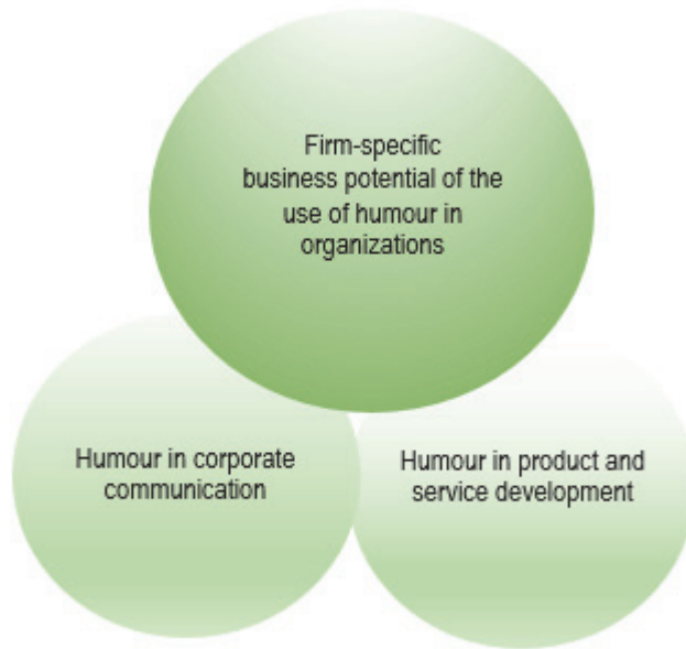
Figure 1. Priorities in the present humour-based research.

As illustrated in Figure 1, the project particularly aims to develop firm-specific business potential for using humour in organizations. This more general approach towards humour is scrutinized more closely with regard two specific areas, as the project discusses the use of humour in both internal and external corporate communication as well as in product and service development. The reason why these specific areas have been selected as targets is, first, that value can be found in the offerings of the firms, and the ways in which those are produced are therefore of essence; and, second, how value is perceived, is to a notable part dependent on how it is communicated. In other words, the ability to affect emotions of employees, customers, and partners may be quite decisive. A more detailed description of the project specifications can be found in Figure 2.