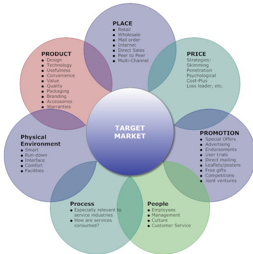
Figure 1. Marketing mix of 7 P's (Acutt, 2015)