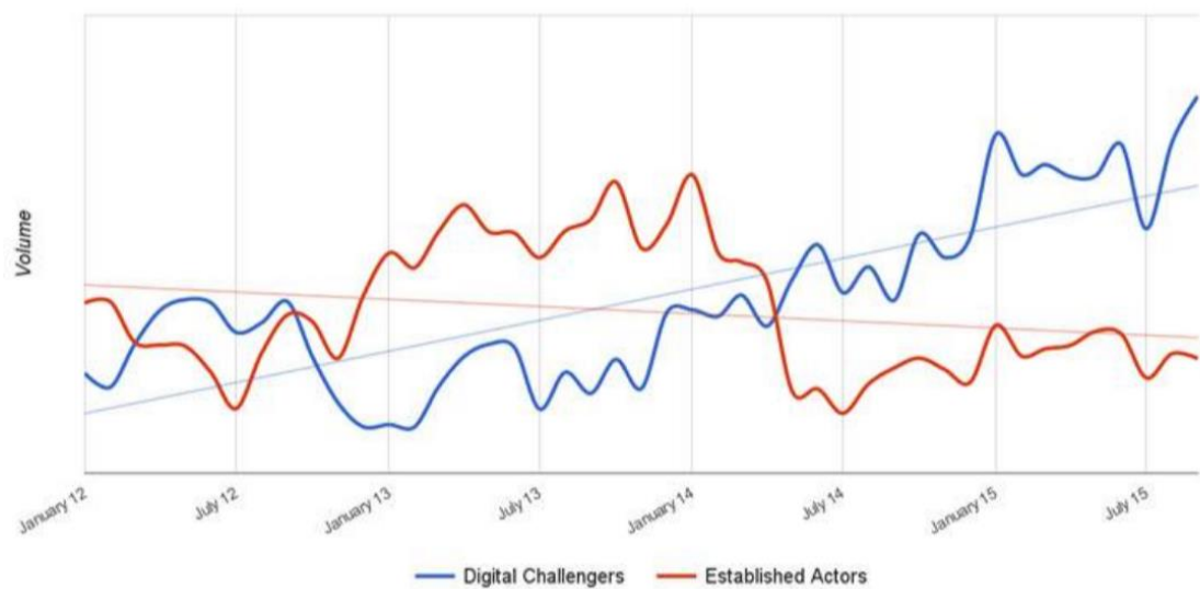
Table 2: The graph illustrating the indexed number of clicks resulting from queries for home mortgages mirroring the development in consumer behaviour.

The increasing popularity of tech giants and other non-traditional competitors within financial sector was illustrated in 2016 when Google conducted study for its FinTech Forum @ Google where it compared the volume of clicks on Google searching the top 500 search terms for different financial service categories. 40 companies examined in the study were divided into two groups: established traditional financial institutions and digital challengers mostly start-ups and tech companies. The result of the study, pictured in the table 2 below, clearly showed ongoing trend of increased demand and interest in non-traditional digital competitors and declining interest in traditional financial institutions (Stuge, et al , 2016).