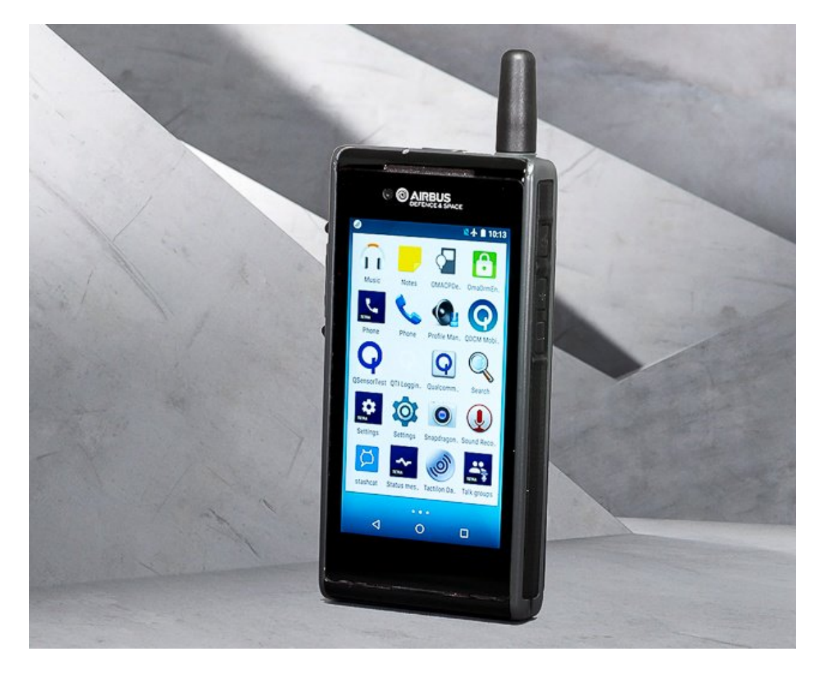
Figure 1 Tactilon Dabat

Much like TETRA networks, TETRA radios have developed in their lifetime; however, not really as much as they should have. They have become lighter, smaller and more durable. They have color displays now and they have gained some new features. But. They are still very much the same devices with the same functions as 15 years ago.