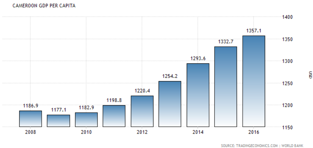
Figure 2 Cameroon GDP per Capita (Tradingeconomics.com)

The latest GDP recorded by Cameroon was in the year 2016 and statistic shows that the GDP was approximately 1357.10 US dollars. Which sum up to 11 percent of the world GDP