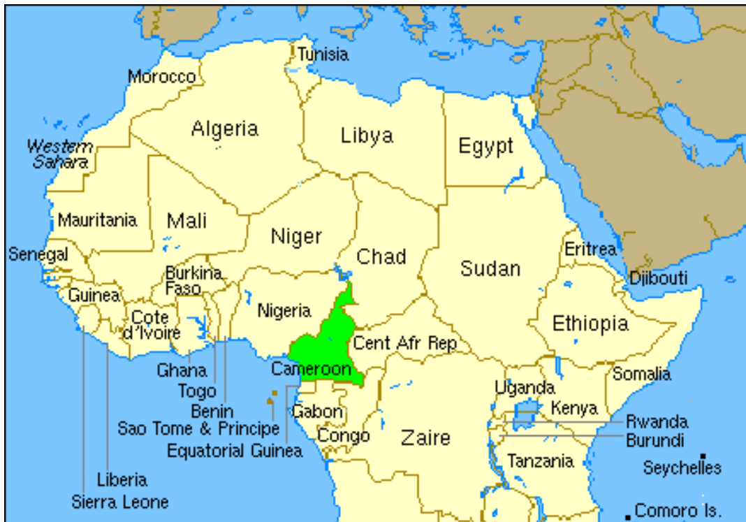
Graph 1. Map of Cameroon