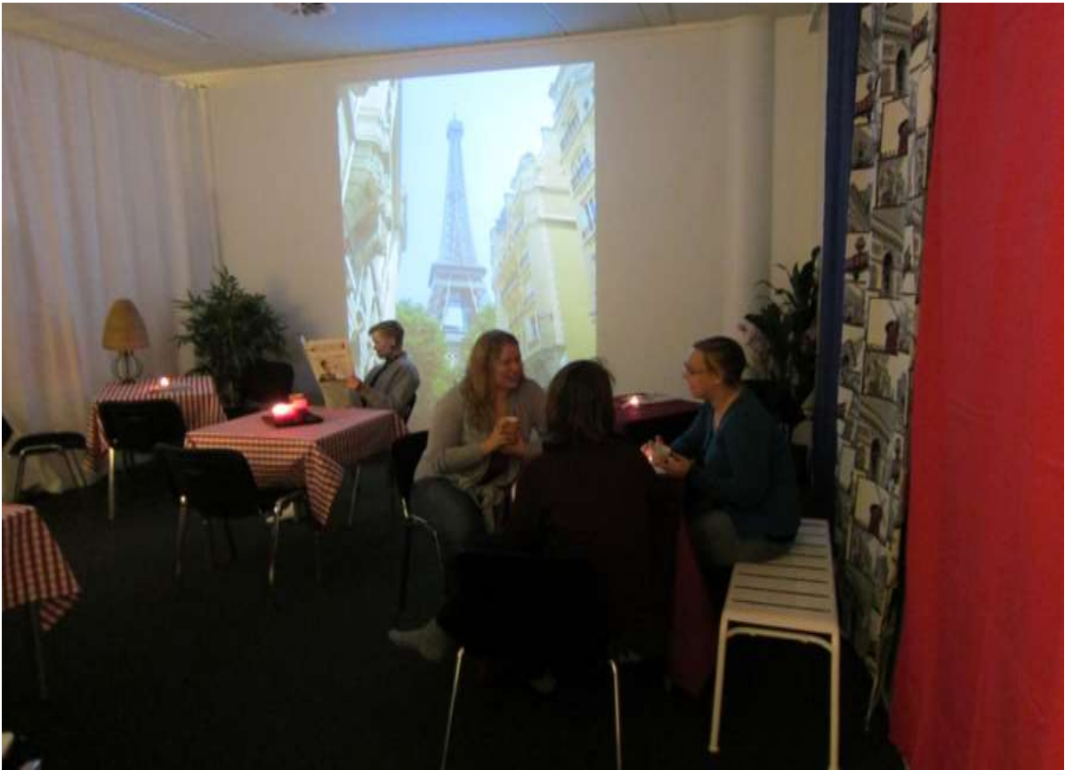
Fig 3. Multisensory Space for a French language café