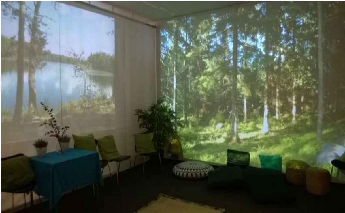
Fig 2.Multisensory Space for nature or relaxation.