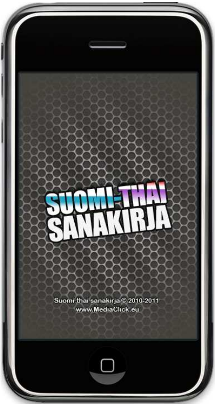
Figure 11: Application's main view.