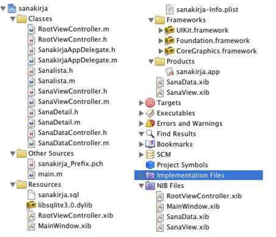
Figure 10: Files needed shown in Xcode IDE.

My iPhone application constructs of the files seen in fig 10. Files in the Classes folder are the main files where the actual code is written. The .h files are header files which contain our variable definitions. The .m files are invoked by main.m file and these files contain necessary code to make application work as desired.