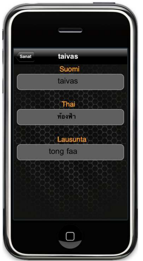
Figure 15: Grouped table view to show translation pairs.

The title shown in navigation bar will be given here. Also the number of needed cells is given. /4/