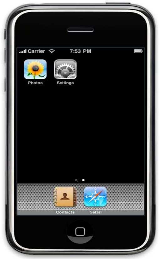
Figure 3: iPhone simulator lookout.