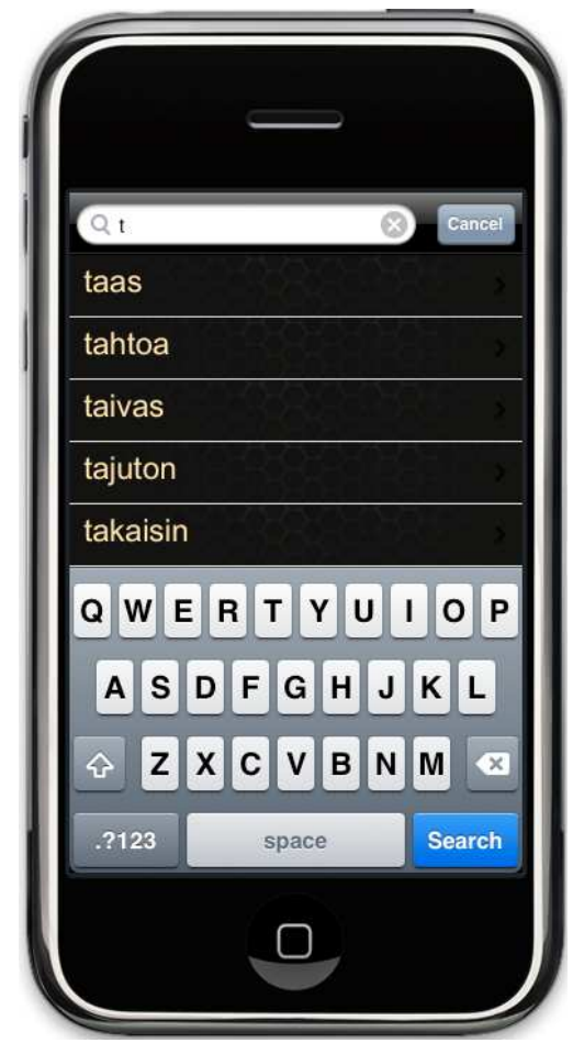
Figure 14: Search result table view.

The declaration of table view cells starts here. If the table shown for user is the normal table view (see fig. 13), the amount of cells for words will come from ListaSanat array row count. If the table view is not that, in this case meaning search result table view (see fig. 14), the amount of cells will come from search list instead. /5/