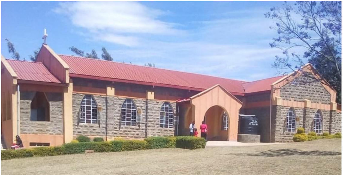
The Figures 2.0 portrays Anglican Church in Mai-Mahiu

Anglican Church of Kenya Mai-Mahiu division was established over 25 years ago. The church was established by five families. The families through the help of Anglican