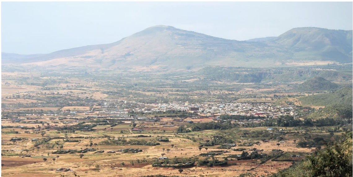
Figure 1.0 portrays Mai-Mahiu town

Mai-Mahiu town is located in the escarpment of the Great Rift valley around 50km from capital city Nairobi. Mai-mahiu derives its name from kikuyu native language which means “Hot Water”. In the beginning of the town formation, Mai-Mahiu was a small village with few families mine included. The village center, was located in the junction diverging two main roads, one heading to Narok and the other one towards Naivasha town. The surrounding natural environment in Mai-Mahiu was something to be reckoned with. The sceneries were beautiful, and the forests were dense with indigenous trees. Wild Animals were everywhere lions, zebras, giraffes, gazelles, buffaloes, snakes etc. There was a lot of economic development opportunities at that time through tourism.