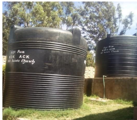
Figure 5.0 Illustrate some water tanks donated by an organization that collaborate with Anglican church in Mai-Mahiu

Some of the beneficiaries have been using the collected water to grow vegetables for home consumption. One of the participant said that the impact the tanks have is high that more and more people are enrolling to the church programs because they can see what the church is doing for them. The church has seen its influence enhanced as an important local institution through provision of opportunities for the church members as well as the community.